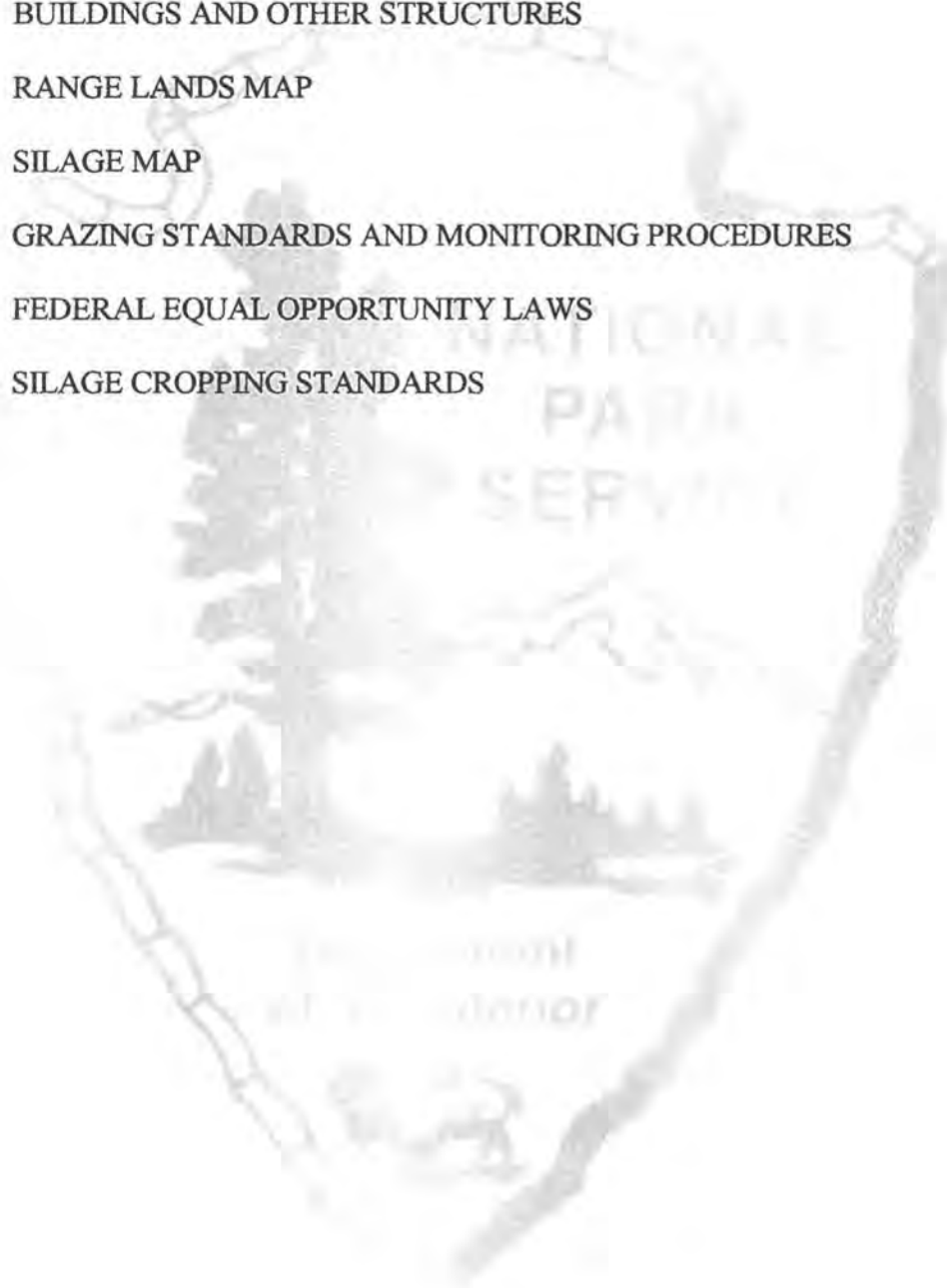
EXHIBIT F: SILAGE CROPPING STANDARDS

EXHIBIT E: FEDERAL EQUAL OPPORTUNITY LAWS