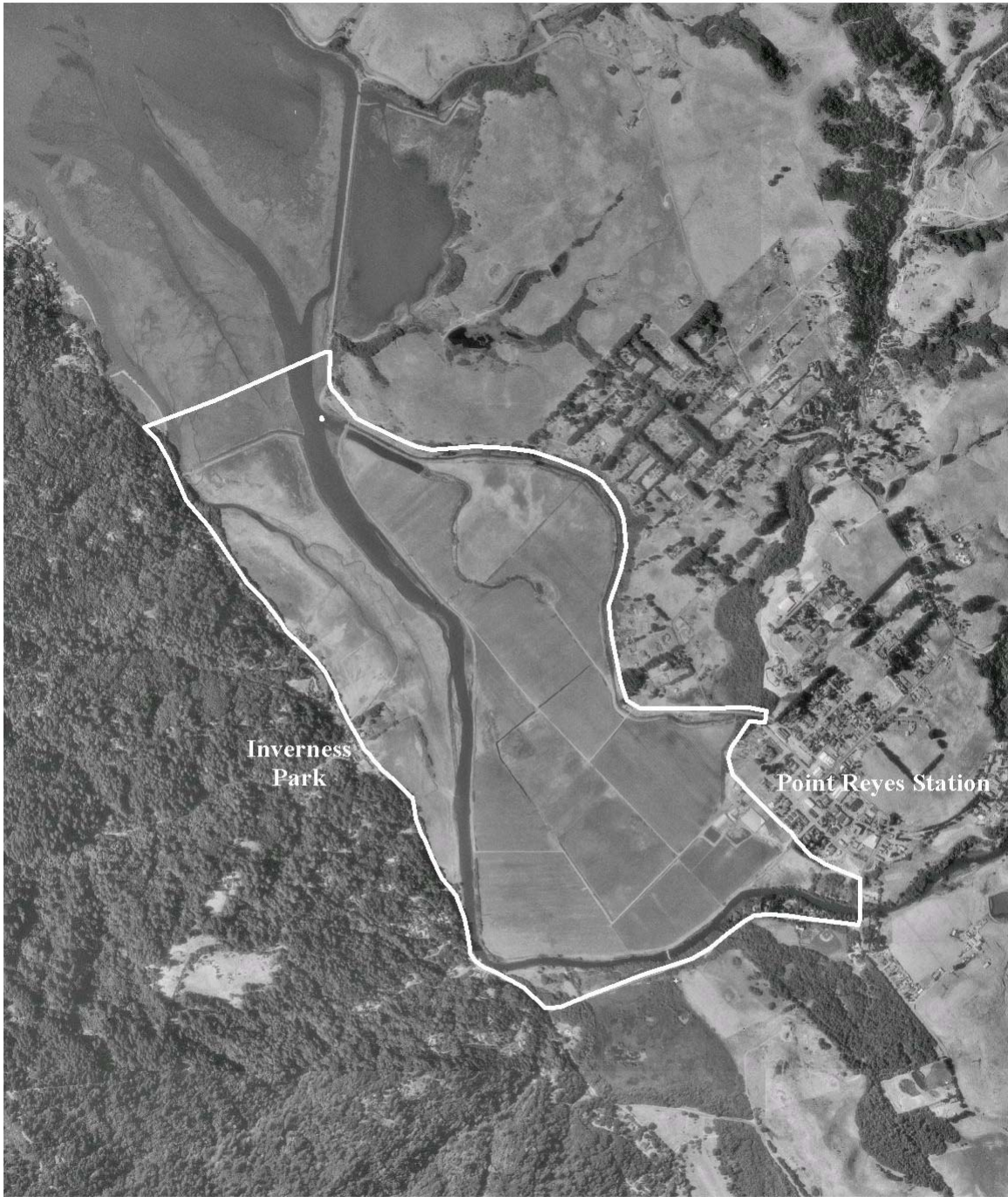
Figure 1. Giacomini Wetland Restoration Project Study Area. Marin County, California.