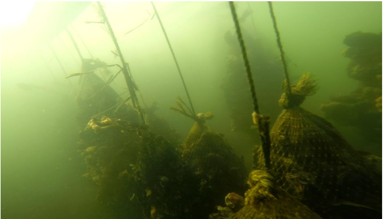
Oyster bags on Rack 4B. 1/6/2015.