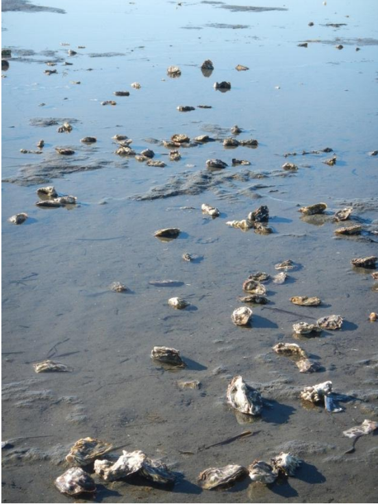
Live scattered oysters. Bed 17. 1/1/2015.