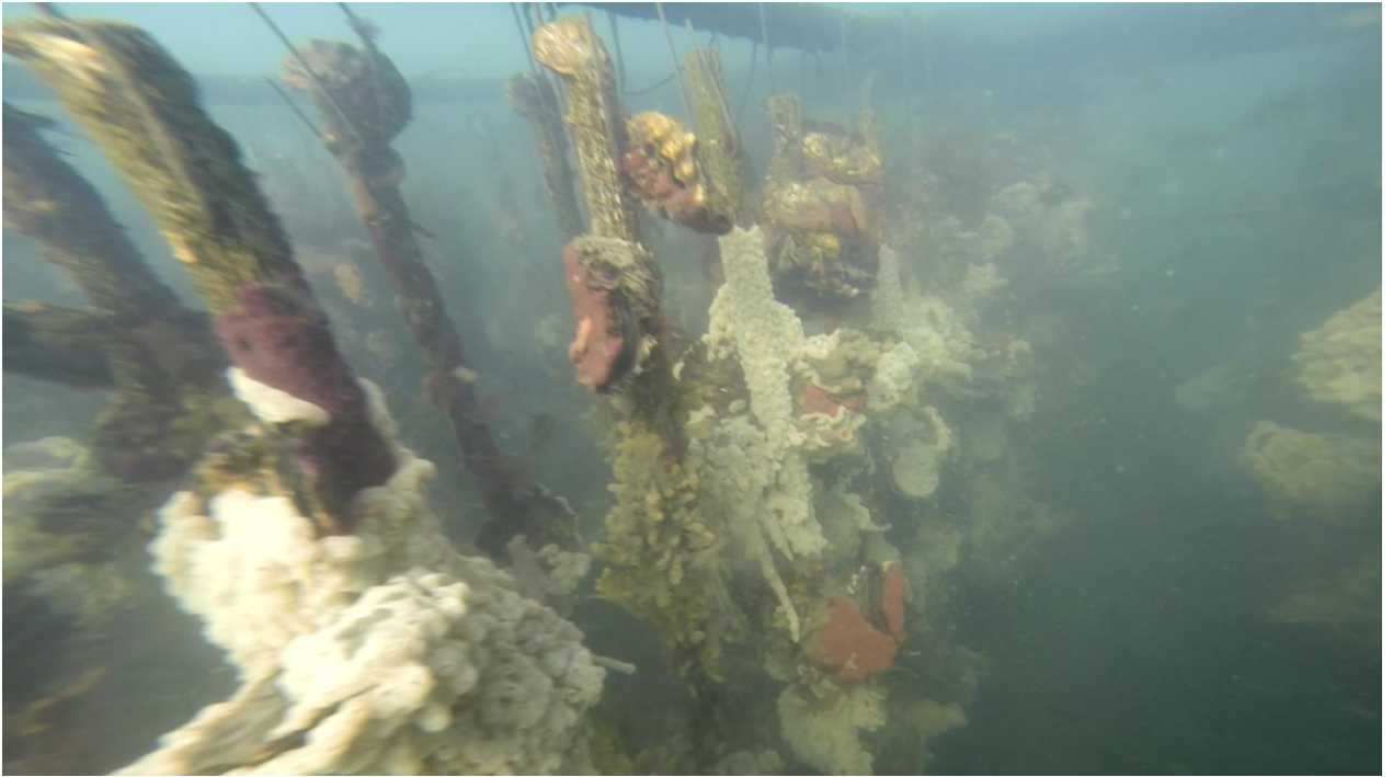
French Tubes, Rack 8S. 1/7/2015.