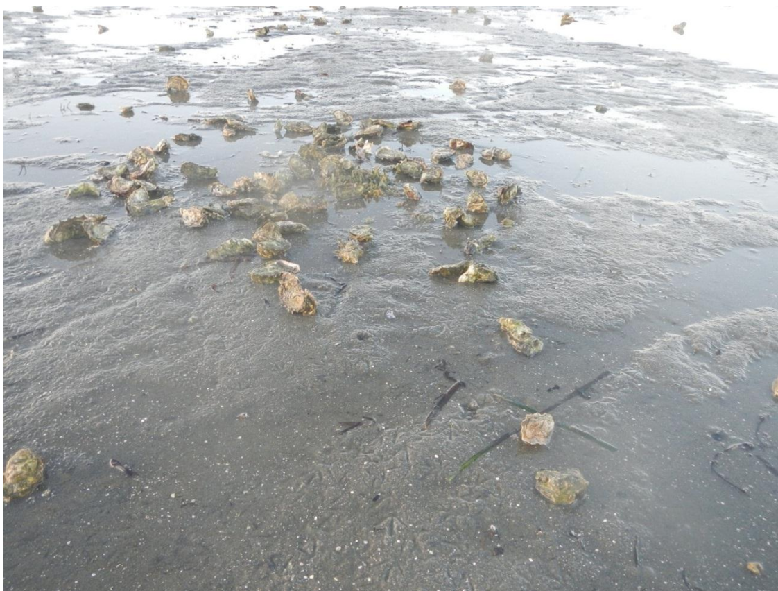
Scattered loose, live oysters, Bed 5. 1/1/2015.