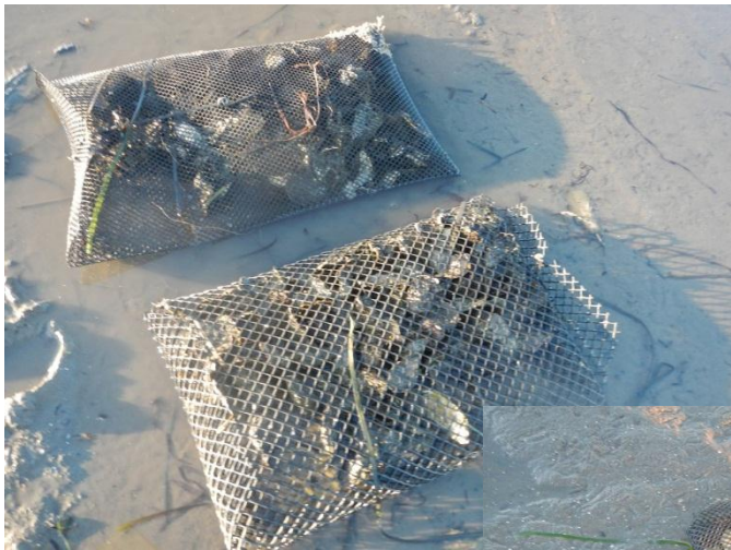
Oyster Bags with live oysters on Bed 7. 1/1/2015.