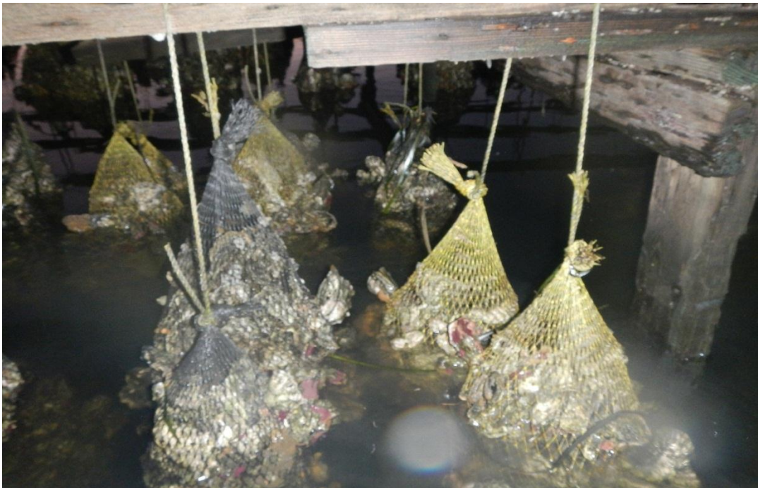
Bags of live oysters Rack 4B. 1/1/2015.