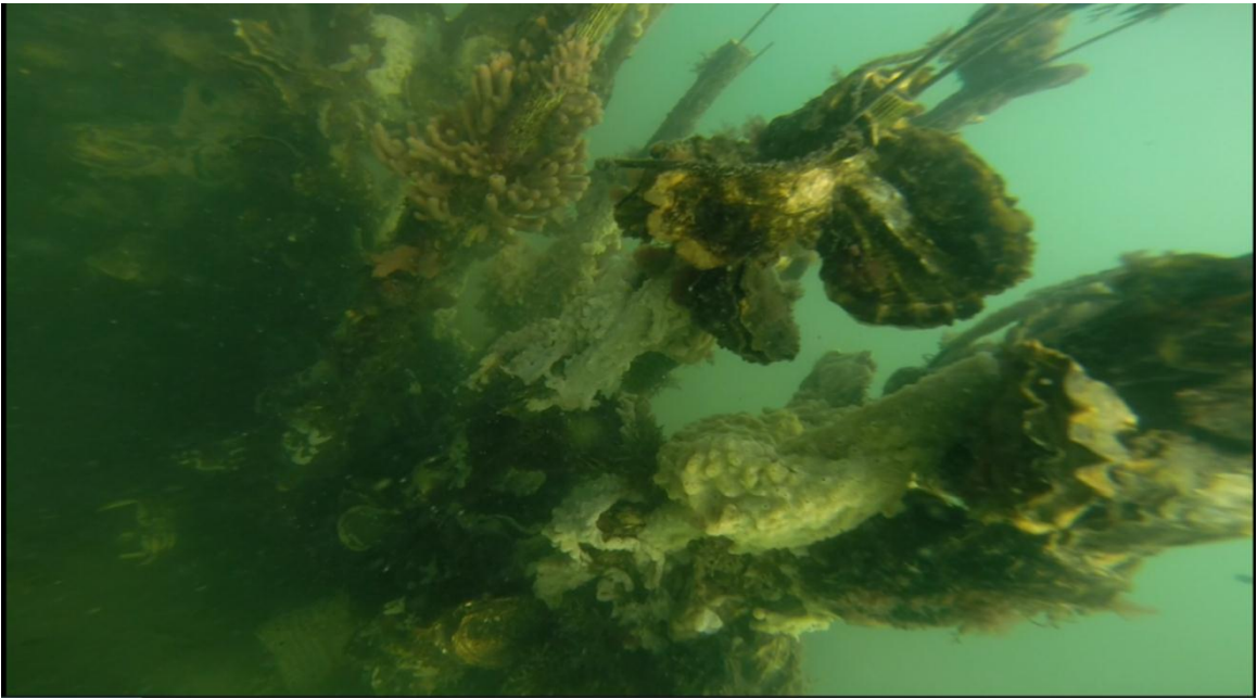
French Tubes, Rack 8S. 1/7/2015.