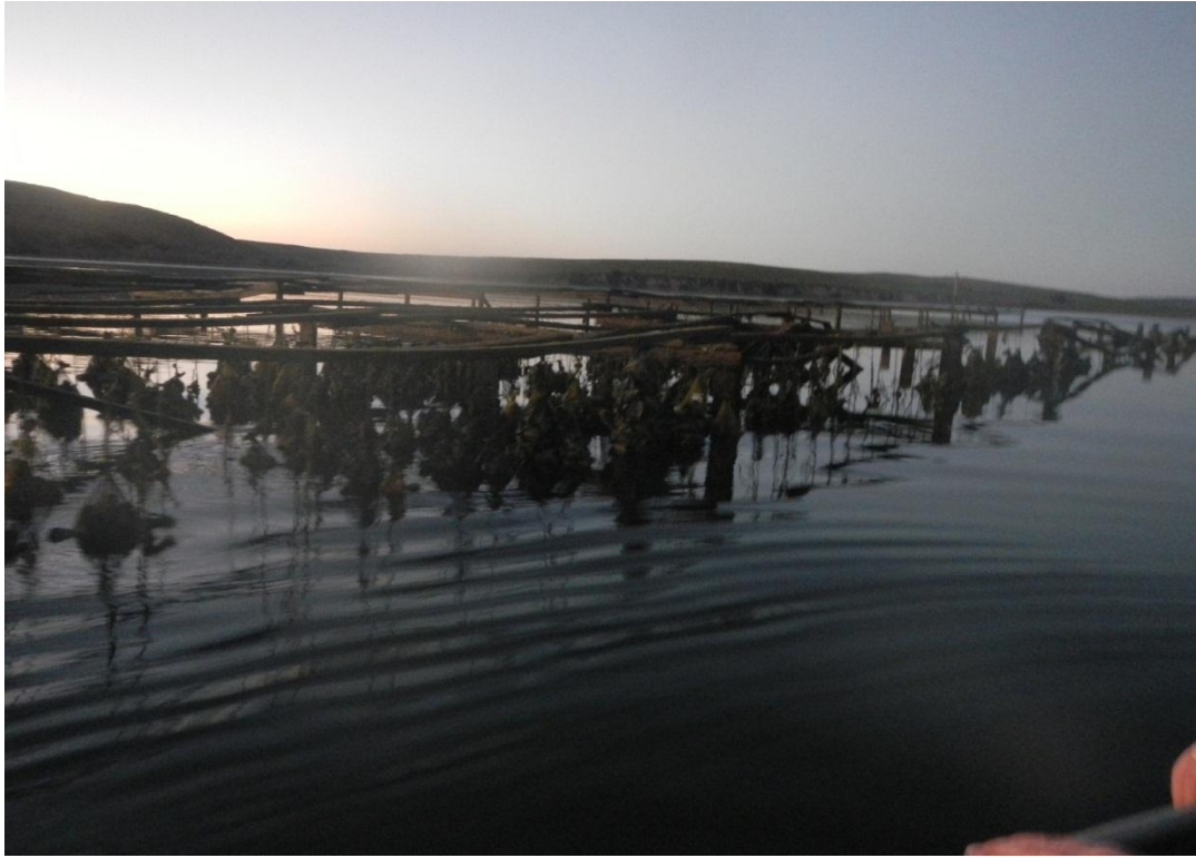
Bags of live oysters Rack 4B. 1/1/2015.