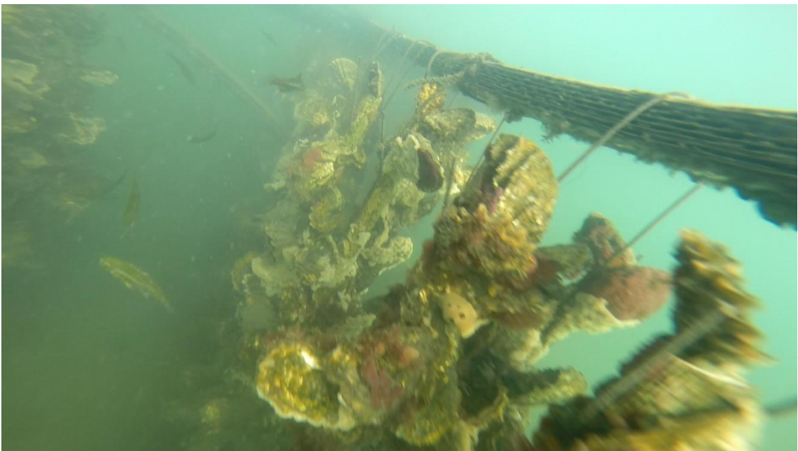
French Tubes, Rack 8S. 1/7/2015.