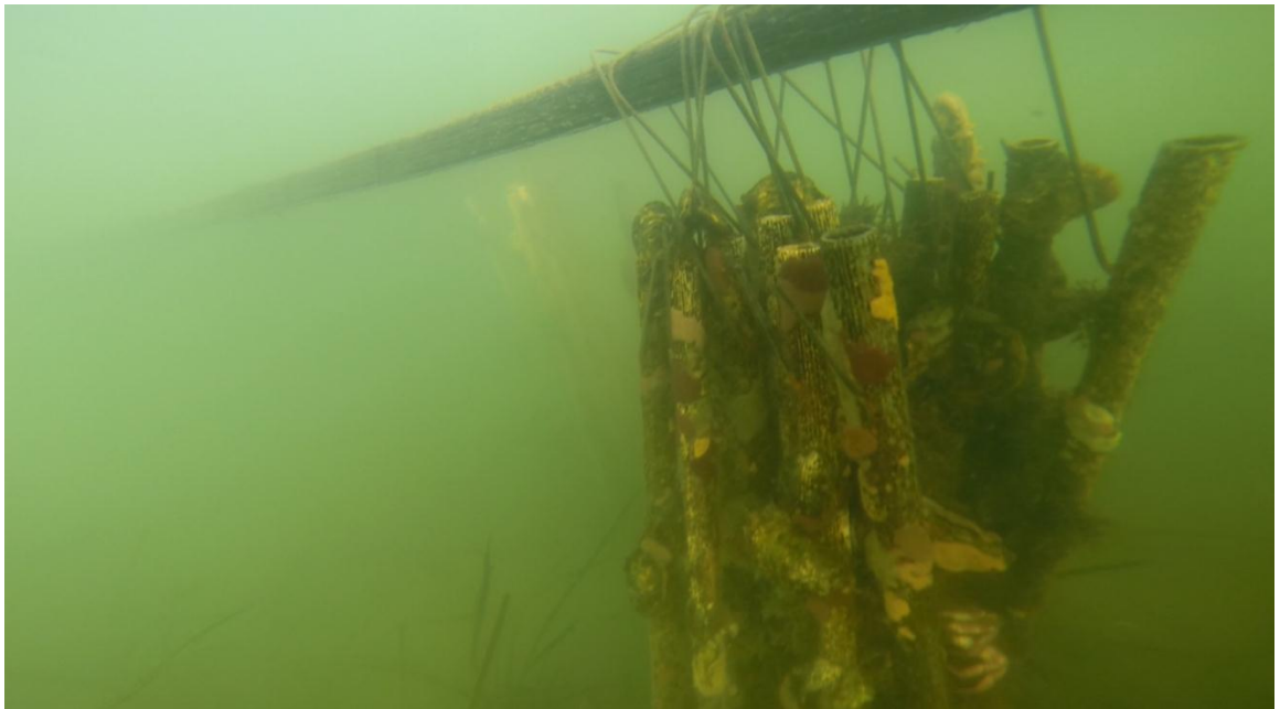
French tubes and spacer strings on Rack 4H. 1/6/2015.