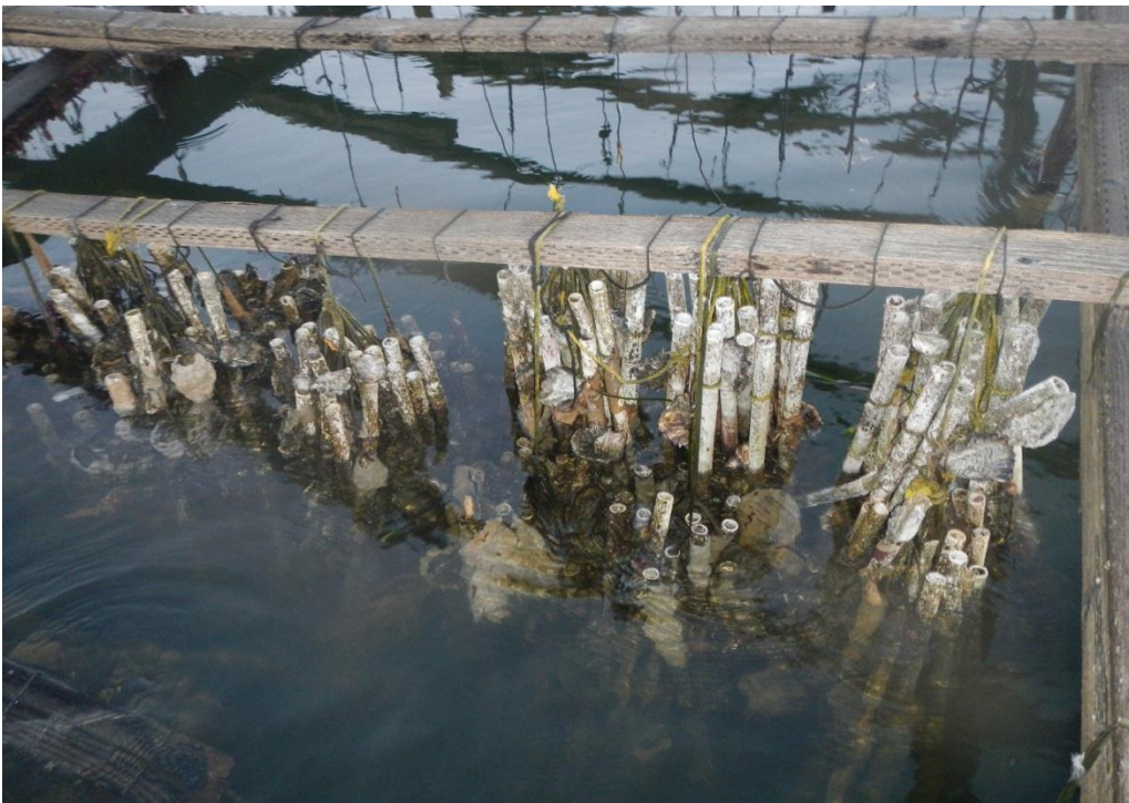
Clumps of French tubes, few oysters, Rack 8. 1/1/2015.