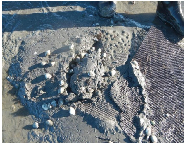
Remnants of broken clam bags on Bed 17. Most clams dead. Some live. 1/1/2015.