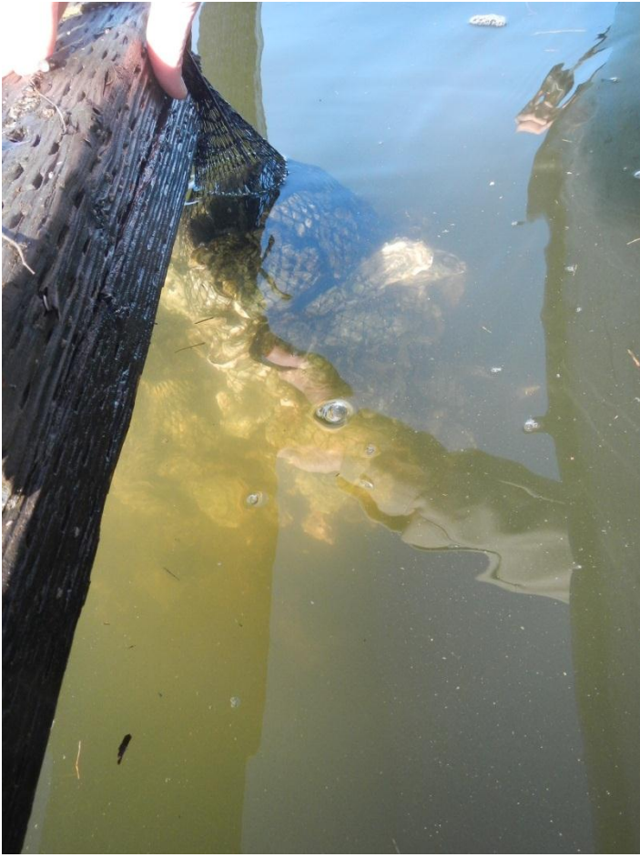
Bag of oysters on Rack 34A. 1/1/2015.