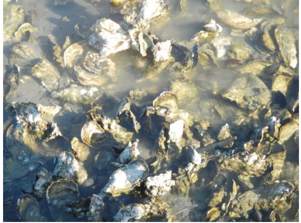
Live oyster pile on Bed 17. Approx. 6 ft diameter. 1/1/2015.