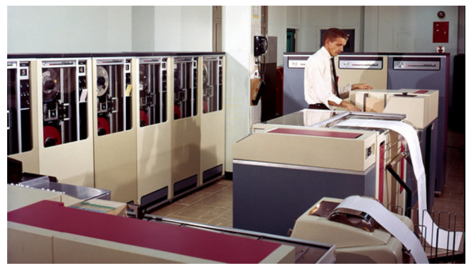
Hopefully you have a newer computer?

A number of self-paced, on-demand NPS eLearning opportunities are also available: