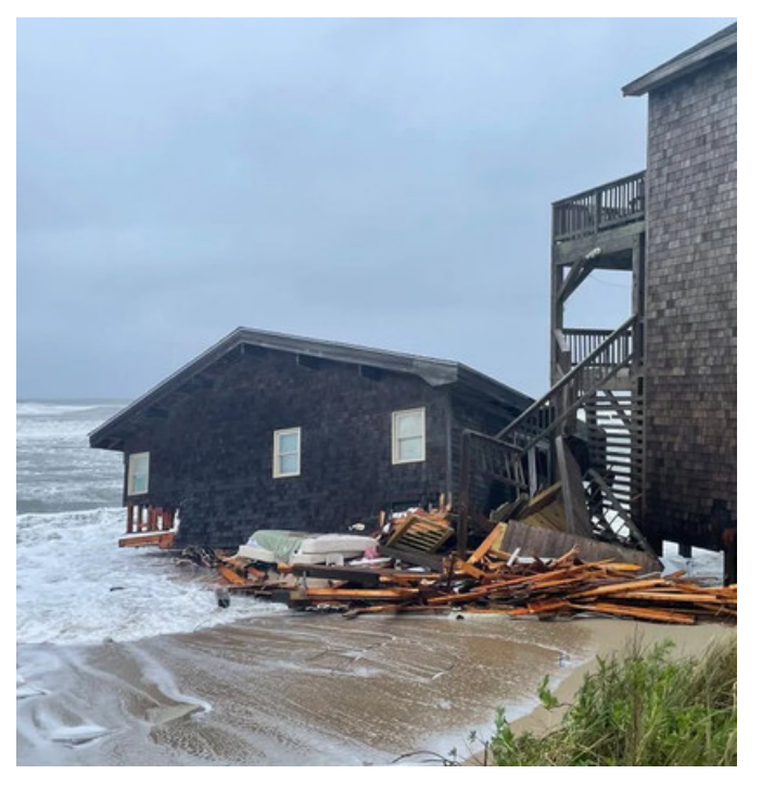
From Cape Hatteras National Seashore: two houses collapsed this month because of coastal erosion and stormy weather. NPS Image.

Why homes are collapsing on Cape Hatteras National Seashore,