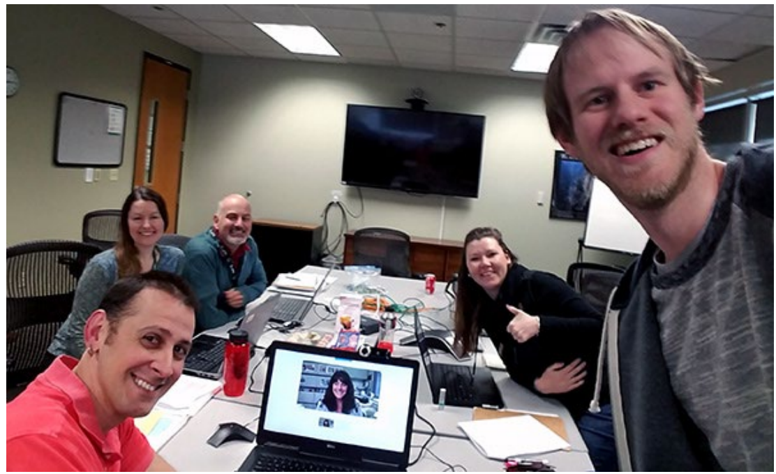
The fine instructor team from the previous course offering