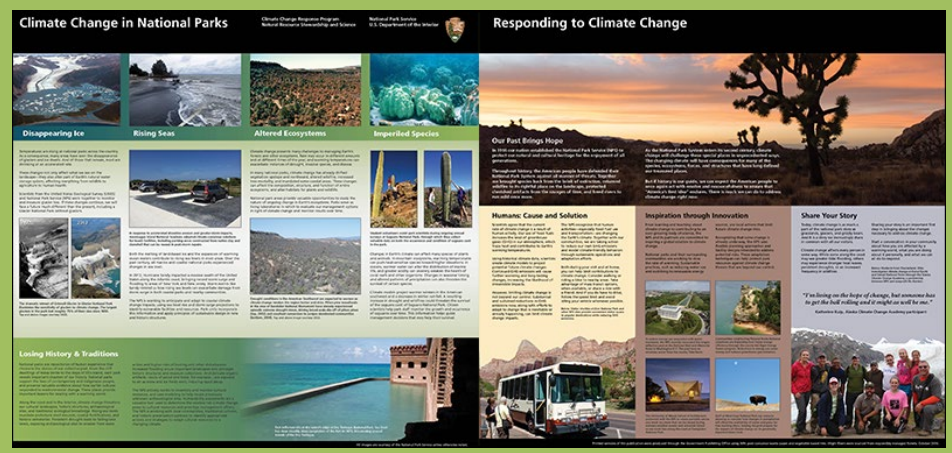
Click the preview above to view the full brochure [PDF]

Our most recent printing of the Climate Change in National Parks unigrid brochure has arrived and boxes are ready to mail out to interested parks. Contact <a href="mailto:climate_change@nps.gov">climate_change@nps.gov</a> to receive a box of free brochures to use in your programming or for distribution at your visitor center.