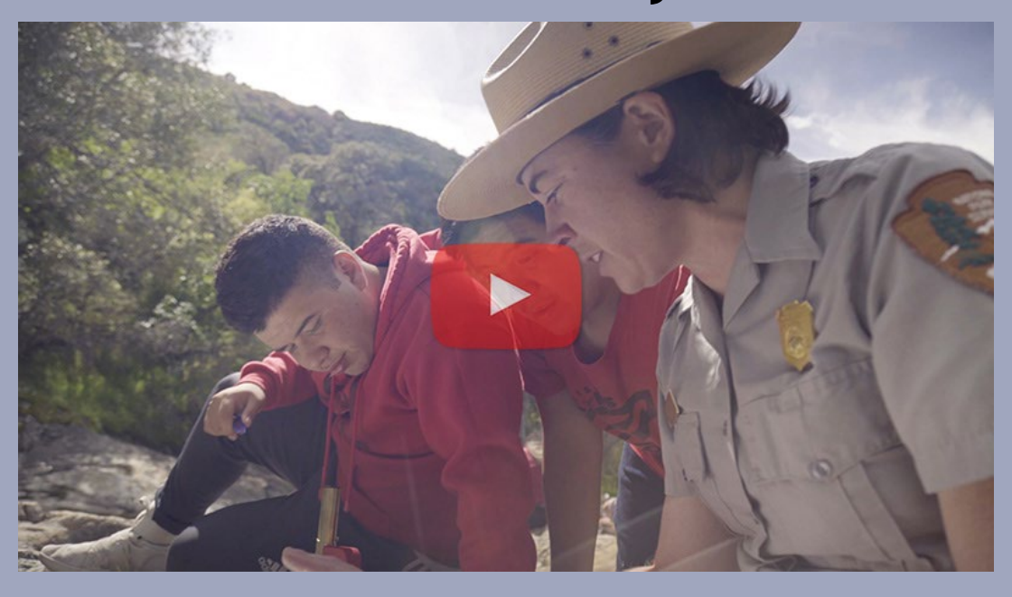
Click the image above to view the Climate Change Academy video on YouTube.

As national parks across the country gear up to host visiting school groups, its important to remember how POWERFUL those visits can be in changing the lives of students!