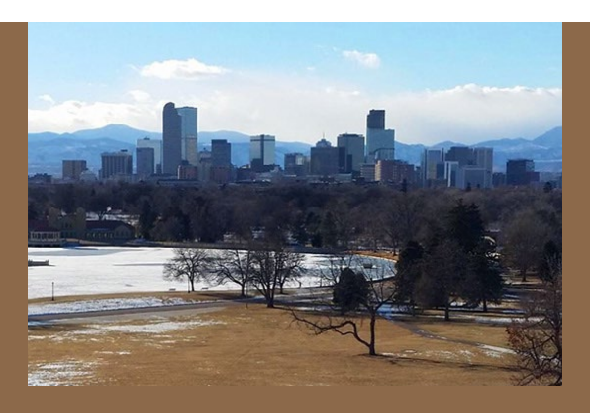
by Geneviève de Messiéres, Earth to Sky Interagency Partnership

Helping visitors find personal relevancy with global climate change can be challenging. The Earth to Sky workshop -- available to NAI 2019 attendees -- is designed to help you meet this challenge through experiential, collaborative learning in a collegial environment.