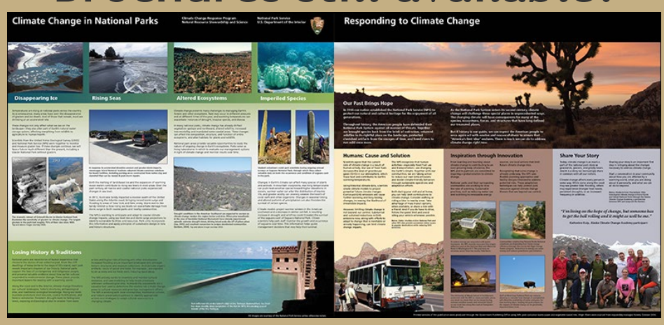
Click the preview above to view the full brochure [PDF]

Our most recent printing of the Climate Change in National Parks unigrid brochure has arrived and boxes are ready to mail out to interested parks.