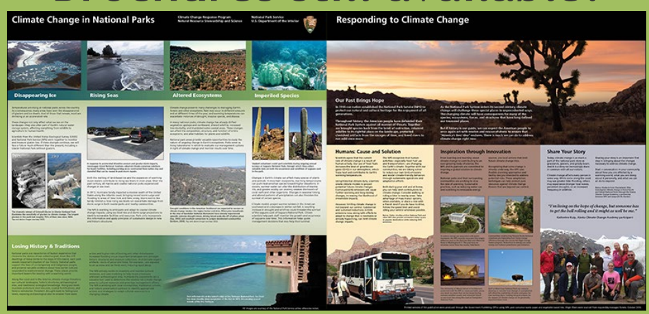
Click the preview above to view the full brochure [PDF]

Our most recent printing of the Climate Change in National Parks unigrid brochure has arrived and boxes are ready to mail out to interested parks. Contact <a href="mailto:climate_change@nps.gov">climate_change@nps.gov</a> to receive a box of free brochures to use in your programming or for distribution at your visitor center.