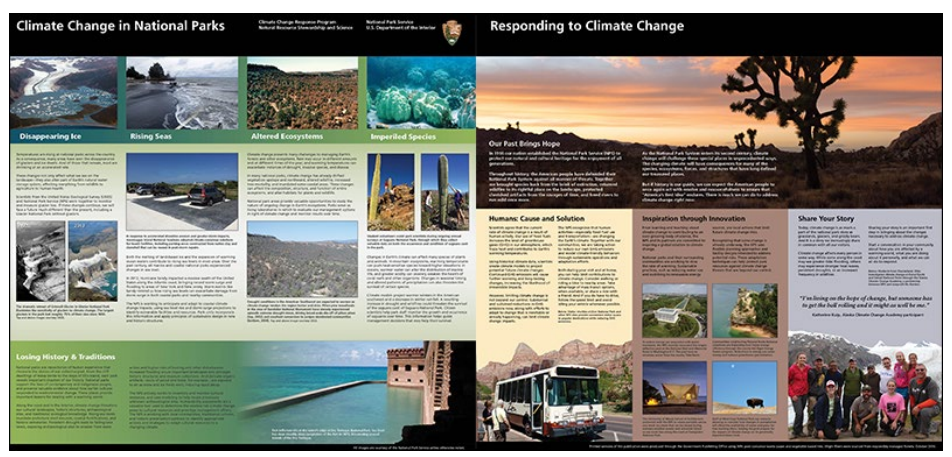
Click the preview above to view the full brochure [PDF]

Our most recent printing of the Climate Change in National Parks unigrid brochure has arrived and boxes are ready to mail out to interested parks. Contact <a href="mailto:climate_change@nps.gov">climate_change@nps.gov</a> to receive a box of free brochures to use in your programming or for distribution at your visitor center.