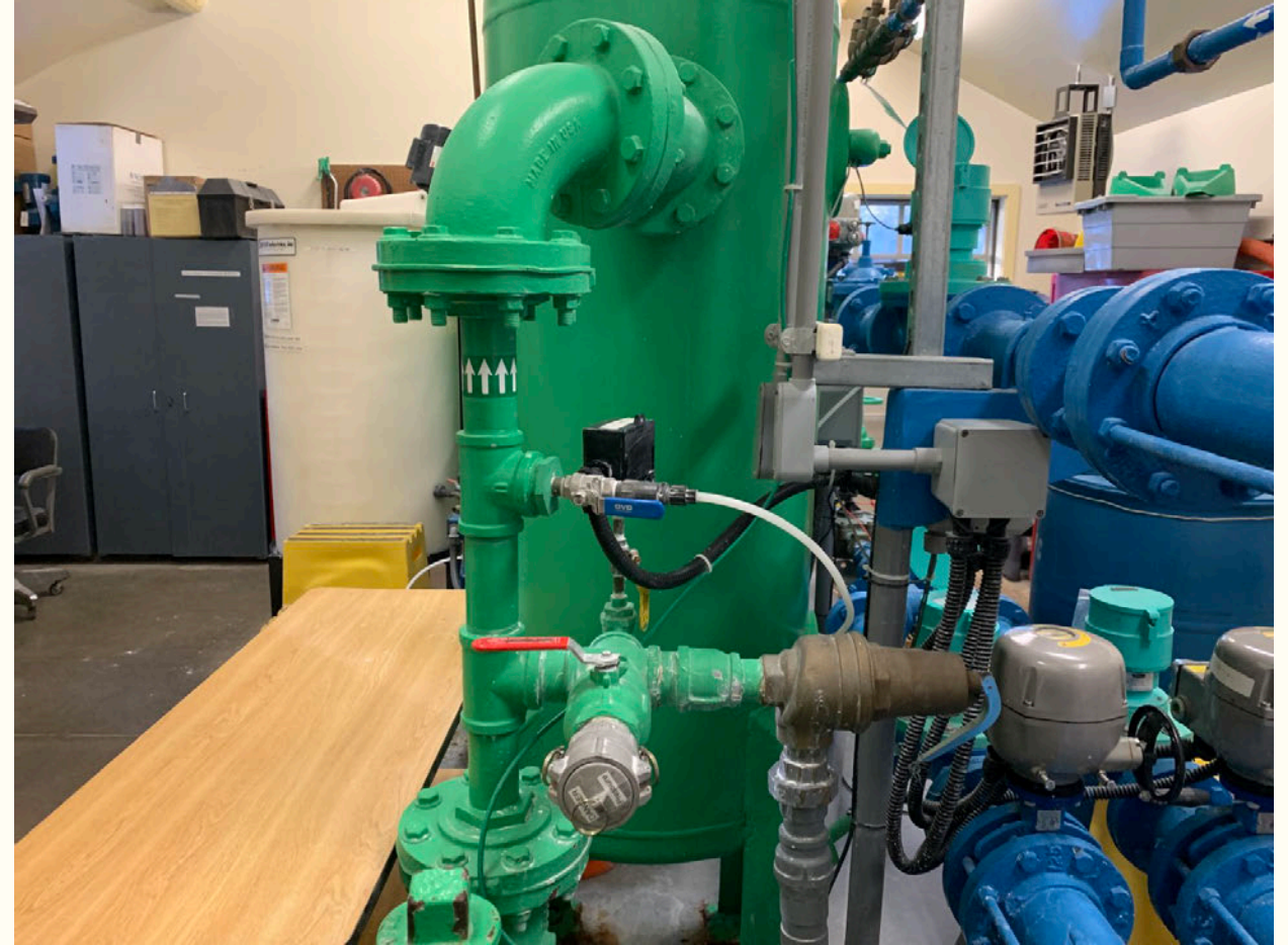
Water treatment facility is in need of modernization