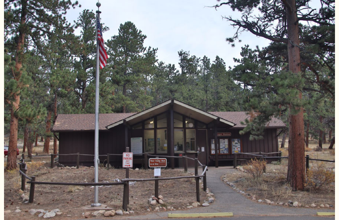
The existing Mission 66 era Ranger Station requiring rehabilitation