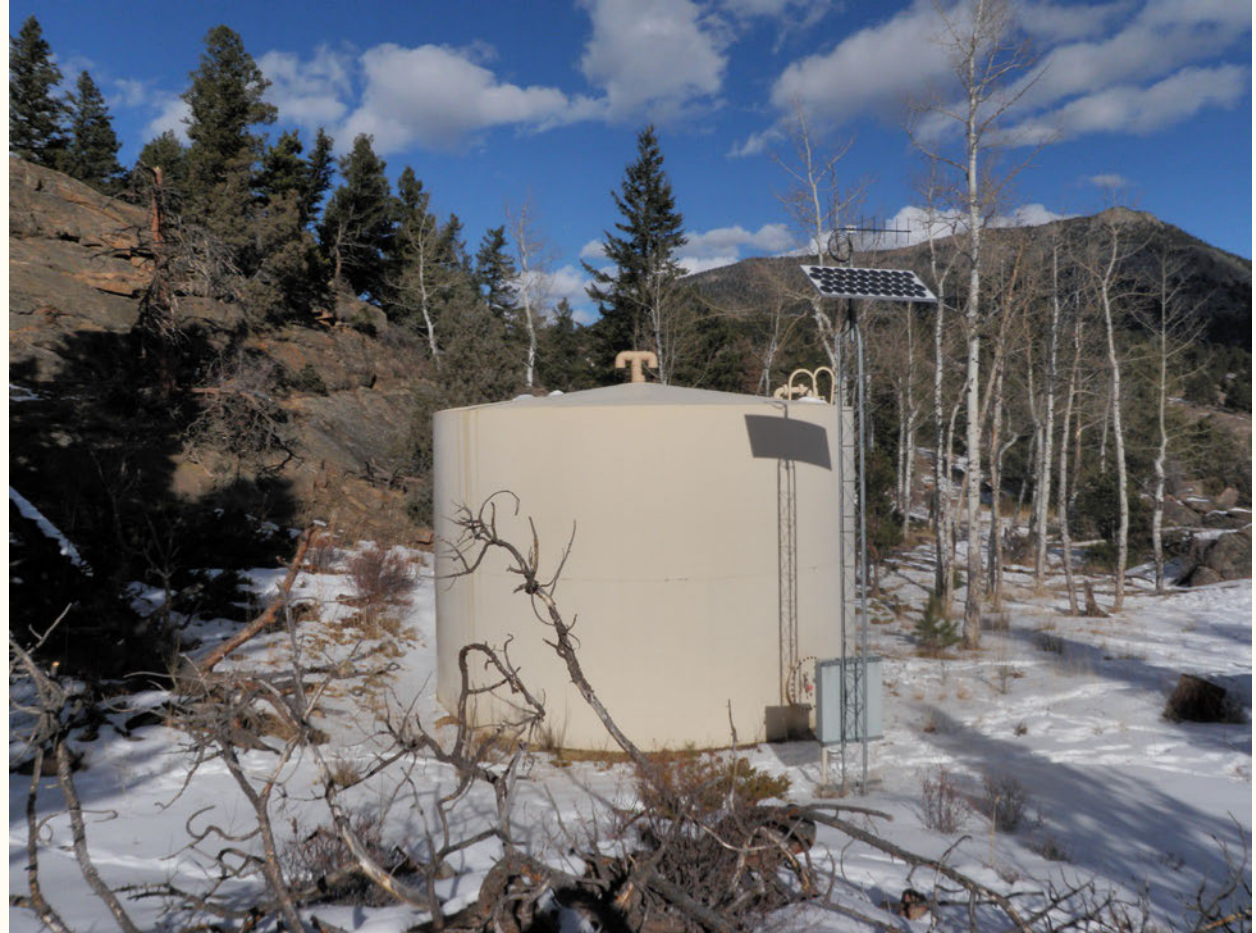
One of several water tanks that will need replacement