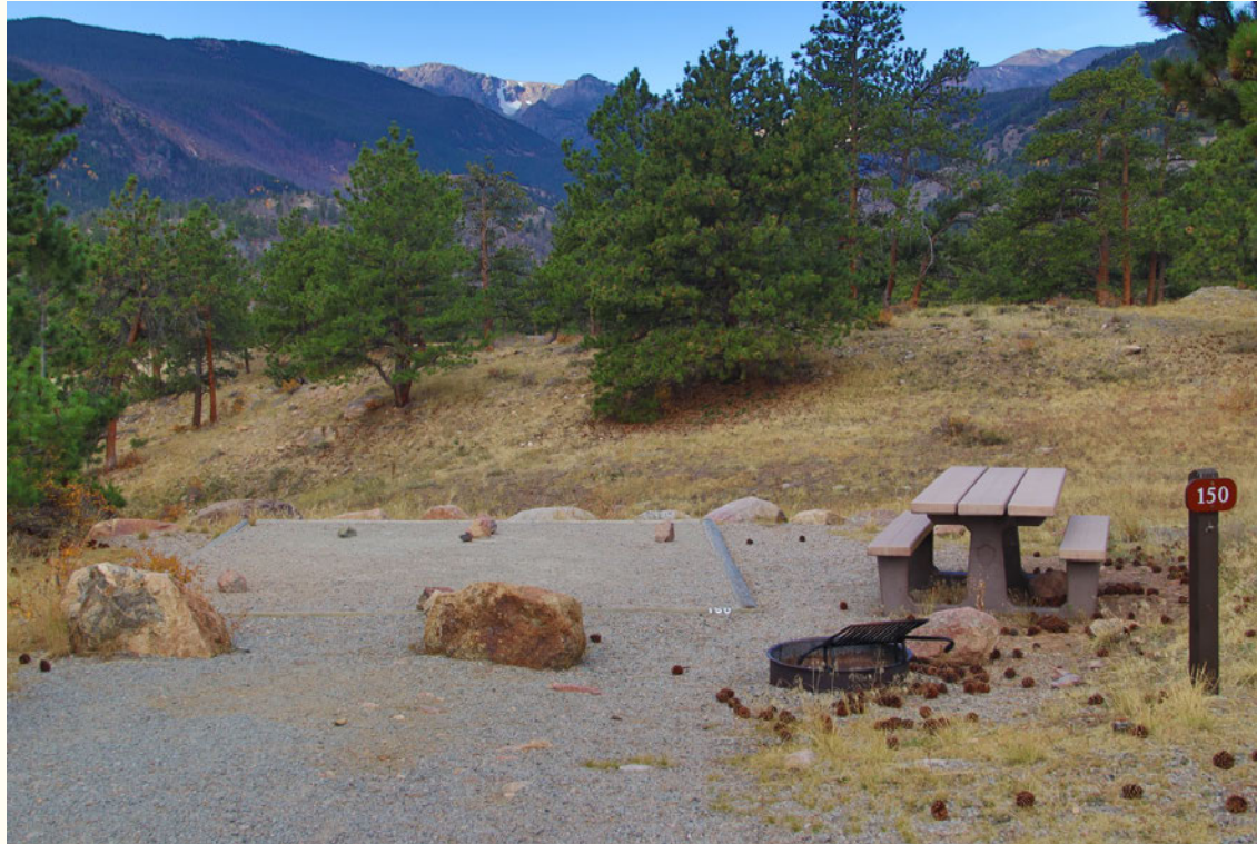
One of several campsites that will need rehabilitation and accessibility upgrades