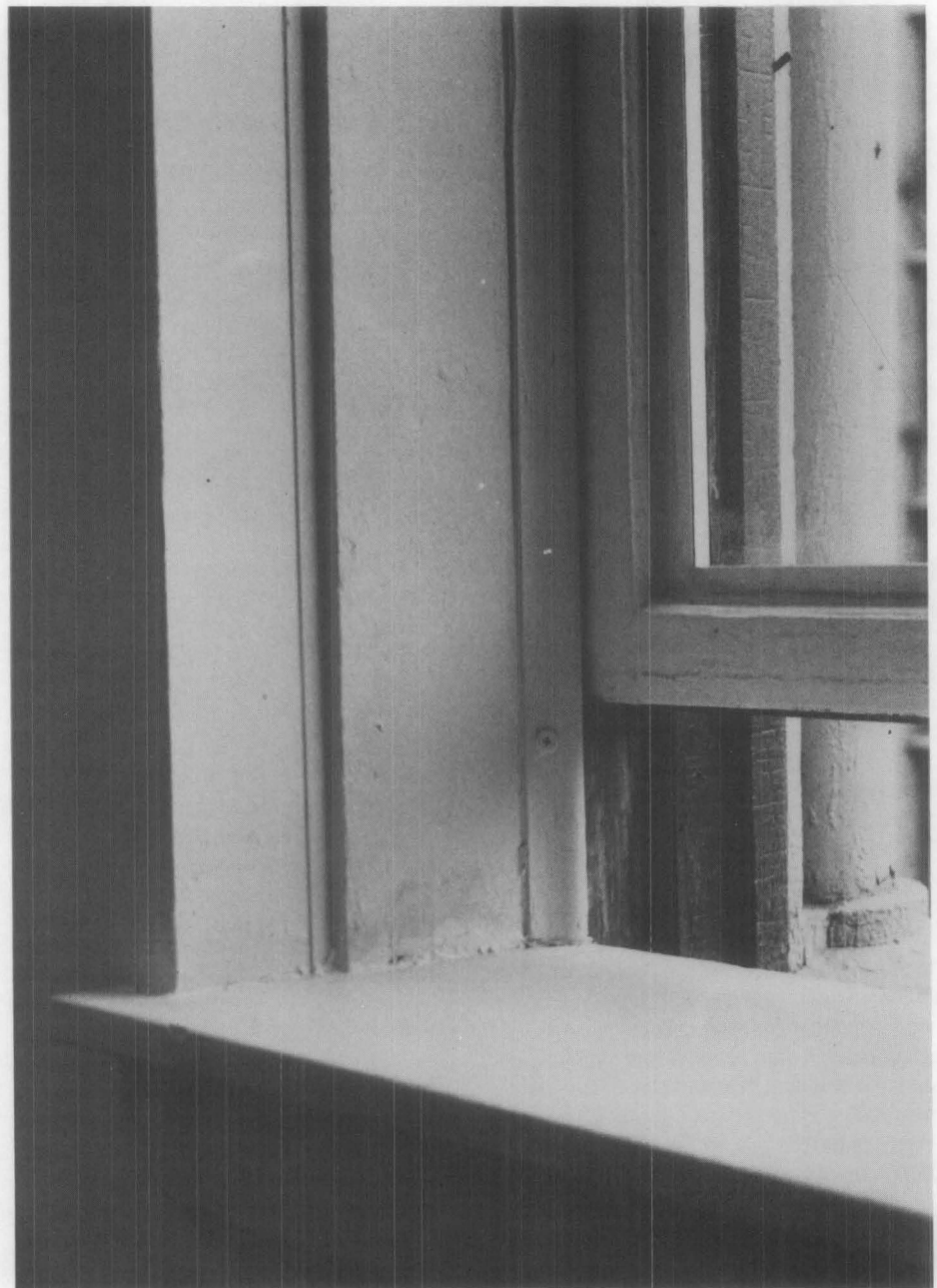
Figure 1. Since the metal spacer placed between the glass sheets is set slightly off the edges of the rails and stiles, the retrofitted insulating unit reduces the historic glass exposure by about 1/2" along all sides. This change on large windows is hardly noticeable particularly once the flat trim piece is glued in place.

Modification of the window sash was accomplished off site. Each window was tagged, working one floor at a time, prior to shipment to a shop facility nearby. Once in the shop, necessary sash repairs were made, loose paint scraped off, and the glass on the inside surface carefully cleaned.