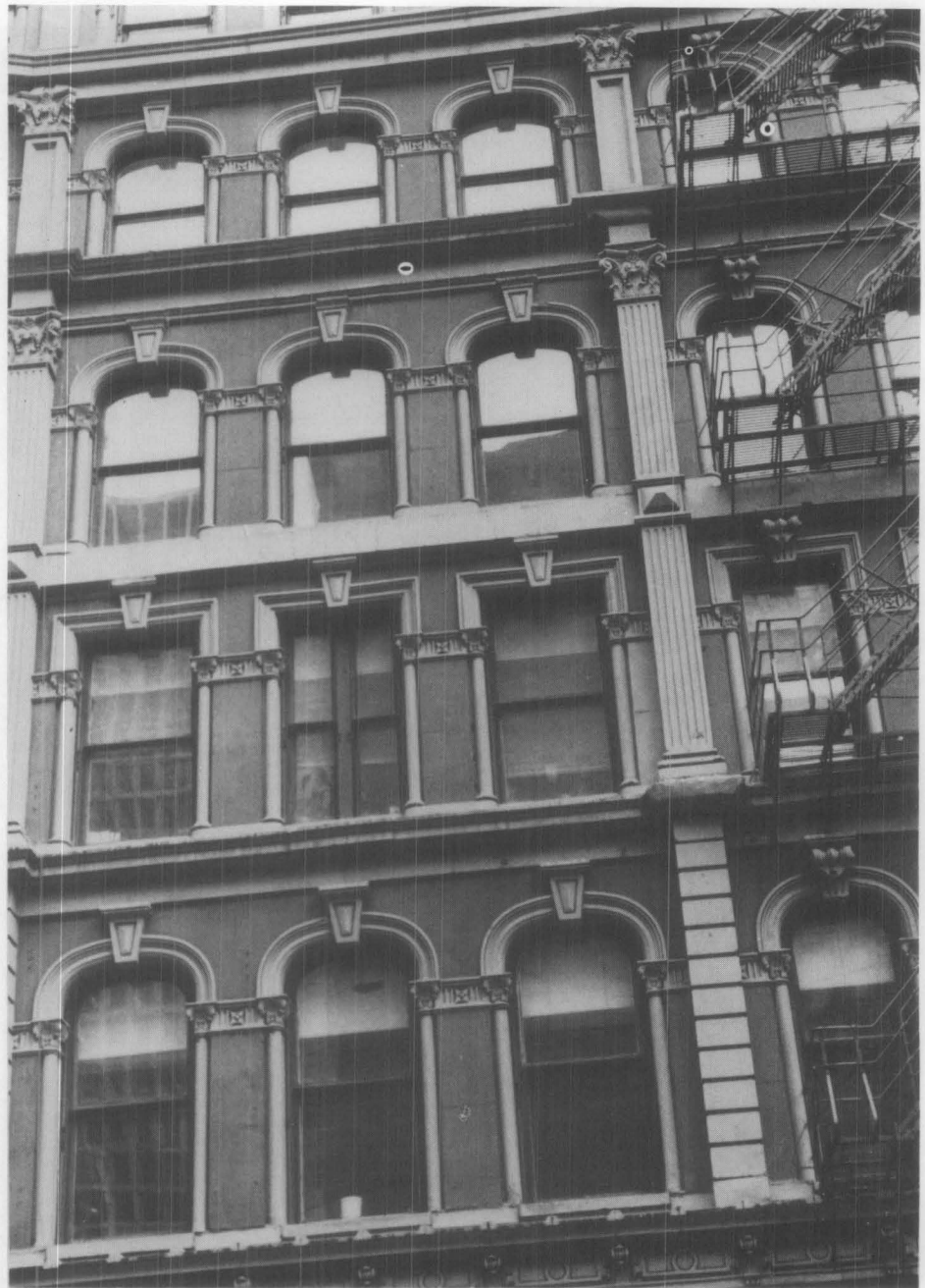
Figure 4. View of the windows on floors 3 thru 6 shows that the technique used for creating sealed insulating glass units in the existing wooden sash had no noticeable impact on the historic appearance of the windows as seen from the street below.

Attractive cost savings over all new sealed units can be realized with this retrofit system, particularly when dealing with arched top sash or windows that vary in size. There are though certain obvious limitations. Where the interior moldings around the inside edges of the rails and stiles are decorative, the manner in which the additional sheet of glass is installed would obscure such detailing. With multipane sash with typical muntin sizes, the encroachment onto