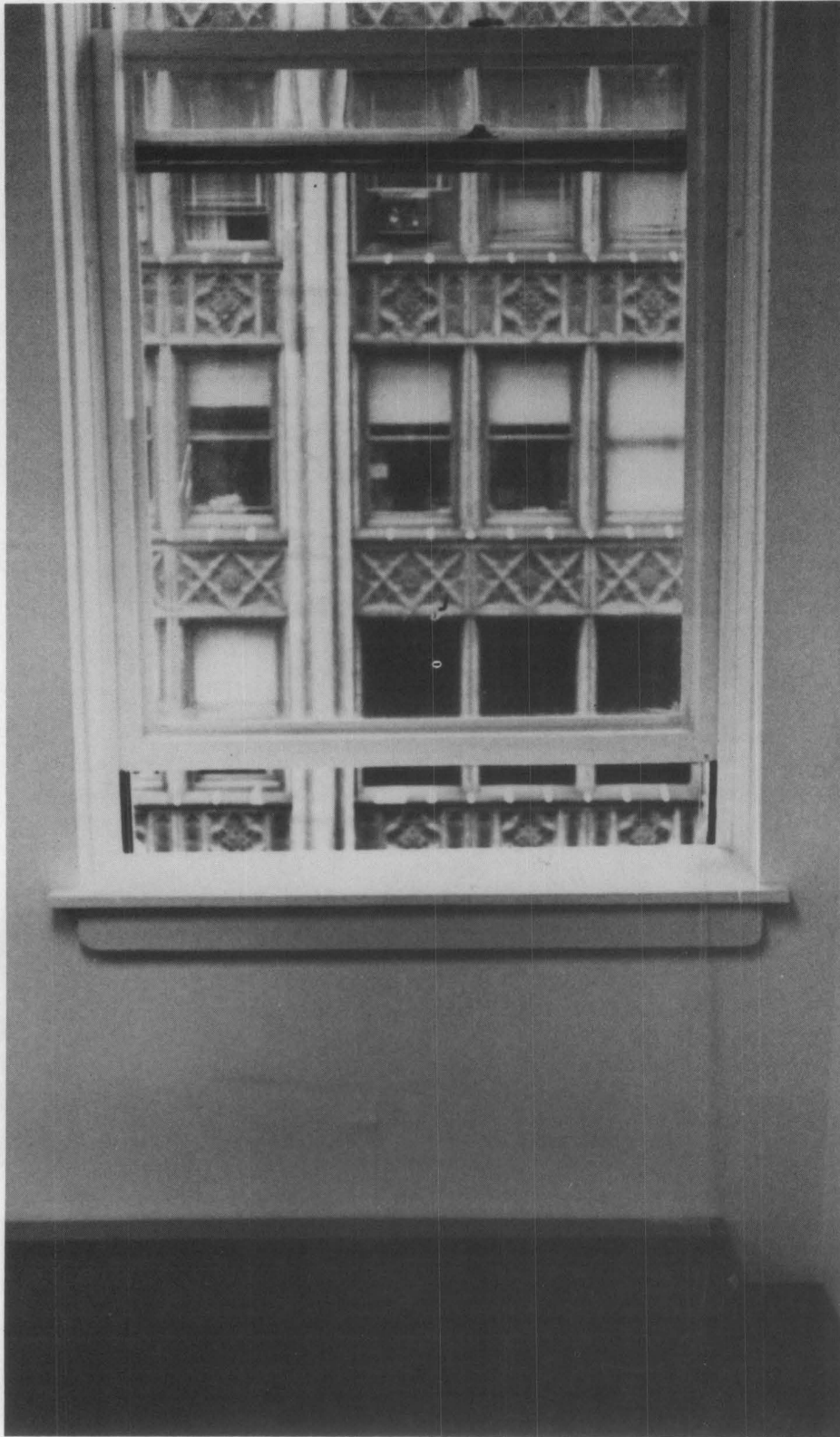
Figure 3. View of the window with the lower sash partially raised following completion of the work. Due to the large size of the sash, the small flat aluminum trim piece covering the spacer had little noticeable effect on the appearance of the windows as viewed from the typical office area.

The primary seal for the insulating unit was then created by applying an electrical charge for about 5 to 10 minutes through the two copper wires. The wire-resistant heating melted the butyl compound on both sides of the spacer since the aluminum spacer easily conducted the heat generated by the wires to the polyisobutylene strip on the opposite face. As a secondary seal to retard moisture collection between the glass and help secure the new glass in the sash, a silicone compound was applied in the space between the wood frame, the old glass and the edge of the new glass and the metal spacer (see figure 2).