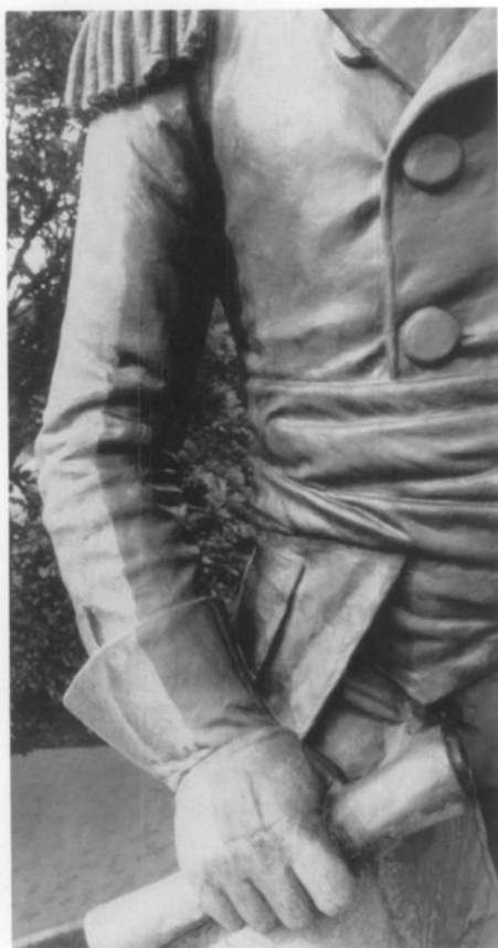
Figure 6. Detail of the Kosciuszko portrait. The chest and inside section of the arm has received its first coating of wax. The outside section of the arm has not.

heat that would have burned previously applied coats of wax.