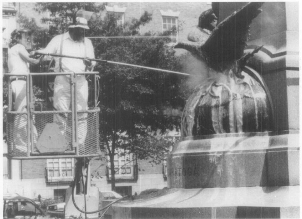
Figure 1. North sculpture group being pressure washed with detergent and water.

Cleaning began with a pressure washing using hot water (250 degrees Fahrenheit) and a non-ionic detergent at three gallon per minute (gpm) and 300–500 pounds per square inch gauged (psig) (see figure 1). This initial cleaning removed considerable amounts of encrusted bird droppings, twigs and leaves lodged behind sculptural groups, mud daubers' nests, and surface dirt and grime. Once the bronze had dried, cleaning continued with the ground walnut shell blasting, using a pressurized pot sandblaster, a