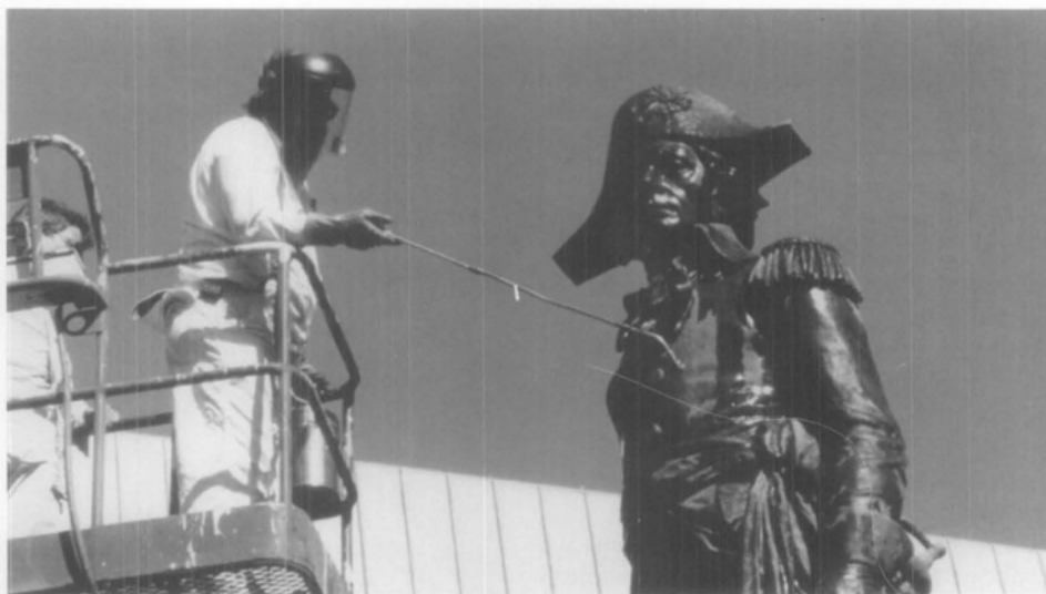
Figure 4. Solution of Benzotriazole (BTA) being sprayed onto the Kosciuszko portrait atop the monument after cleaning with walnut shells.

Once the metal had reached the appropriate temperature, discernible when the applied wax would melt on contact, a prepared mixture of microcrystalline waxes, mineral spirits and BTA was applied sparingly with short bristled natural brushes (See Project Data section for components of the wax). To apply the wax, a scrubbing or jabbing motion was used to insure thorough coverage in corrosion-produced pits and irregularities in the surface that had resulted during casting. Once the bronze had received a coating of wax, it assumed a much darker green-brown color, a semi-glossy surface, and an overall uniformity of appearance far beyond that produced by the earlier walnut shell blasting (see figure 6). A second coating of wax was applied using the same method described above. The technicians found that less heat from the torches was needed during the second waxing. Because the sculptural groups had darkened with the first application, they attracted more solar radiation and therefore reached the necessary working temperature more rapidly. In addition, the technicians were careful not to apply excessive