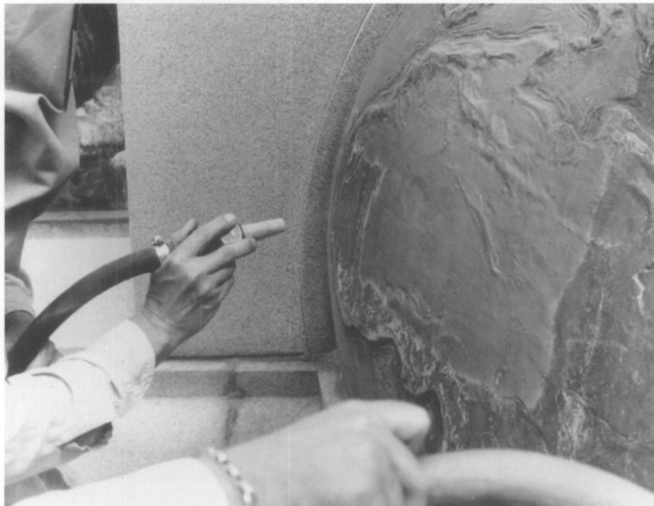
Figure 2. South sculpture group being cleaned with walnut shell blasting.

After the sculptural groups had dried, they were treated with a two percent solution of the corrosion inhibitor Benzotriazole (BTA) suspended in a 4:1 mixture of hot water and ethanol (see figure 4). The solution was applied using a pump sprayer of the type used by insect exterminators. The