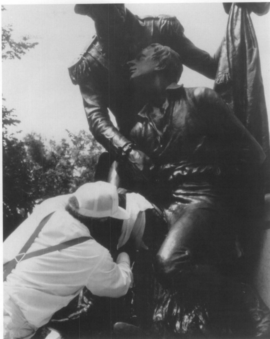
Figure 7. East sculpture groups being buffed after it had received its final wax coating.

The second waxing served two purposes. Primarily, it provided a thicker and more durable protective layer. In addition, it enabled the technicians to detect and fill any areas they may have missed during the initial waxing. After completing the second wax coating, the statues were allowed to cool, expedited by being sprayed with water from a garden hose. Once they were cool and dry, a final paste wax coating was thinly applied without using heat. Soft brushes and damp terrycloth rags were used to apply the paste in much the same manner one would use to wax an automobile. Allowed to cool overnight, the final wax coat was lightly buffed to a gloss with barely damp terrycloth towels (see figure 7). Like the additional coating of BTA discussed earlier, the final application of a cold wax concentrated on the more highly exposed areas that were subject to greatest atmospheric degradation. The final waxing also helped to remove any brushstrokes that may have remained from the two hot waxings (see figure 8).