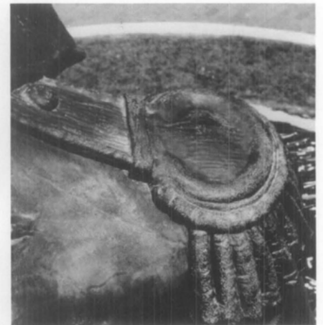
Figure 9. Detail of Kosciuszko's right epaulet [photo taken in June, 1988] showing degradation of the wax coating that occurred during the year following its initial cleaning and waxing.

With the measures taken to clean and wax the bronze statuary of the Kosciuszko Monument, the statues regained the uniform color and the metallic sheen they had possessed before being subjected to years of neglect and the vicissitudes of a hostile environment ( see figure 10 ). Moreover, with regular low-cost maintenance, these statues can be protected from further environmental degradation. Unlike other cleaning methods that remove all existing corrosion, those described here represent minimal intervention and, in accord with accepted conservation standards, are reversible.