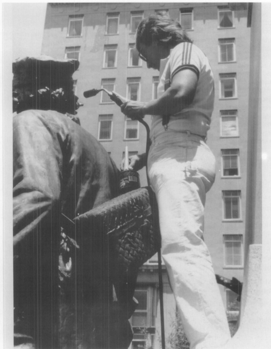
Figure 5. Heating the surface of the west sculpture group in preparation for the application of wax.