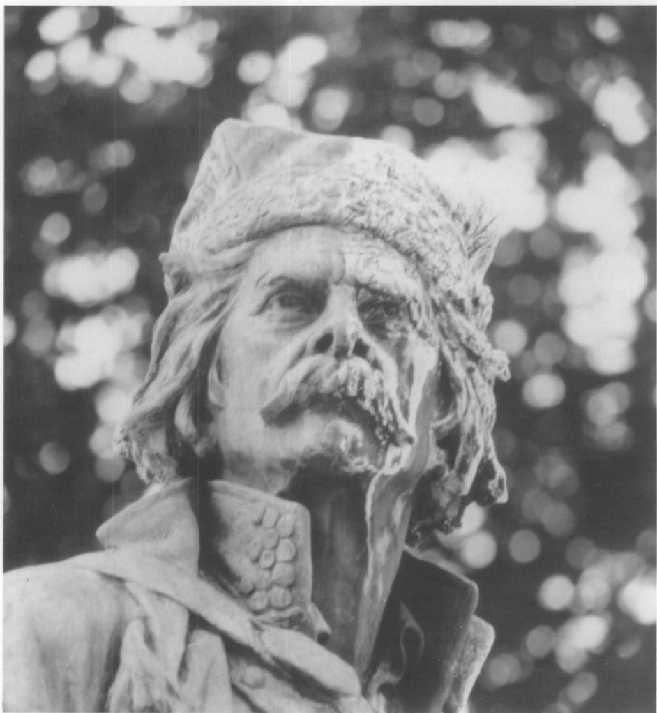
Figure 3. Detail of the west sculpture group, depicting a pair of soldiers. Left half of the face has been blasted and presents a more even appearance than the right half, which has not been blasted and exhibits the light/dark streaking common to corroded statuary.