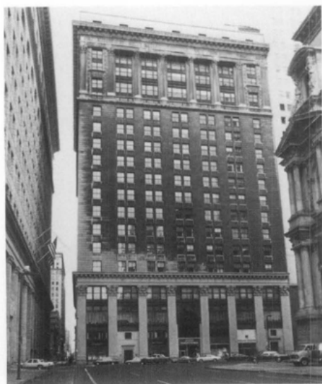
Figure 1. In 1989, just prior to the onset of the rehabilitation project, the Widener Building was showing the effects of 75 years of exposure to an urban environment. Note the lighter color of the left side of the building regularly washed by rain.

The rehabilitation of historic buildings often includes the cleaning of the masonry. Removal of the deleterious deposits of particulate matter from the stone's surface generally enhances the appearance of an historic building and in the case of calcareous stones, furthers the long-term preservation of the masonry by eliminating whatever is damaging the fabric. Since the Widener Building had been subjected