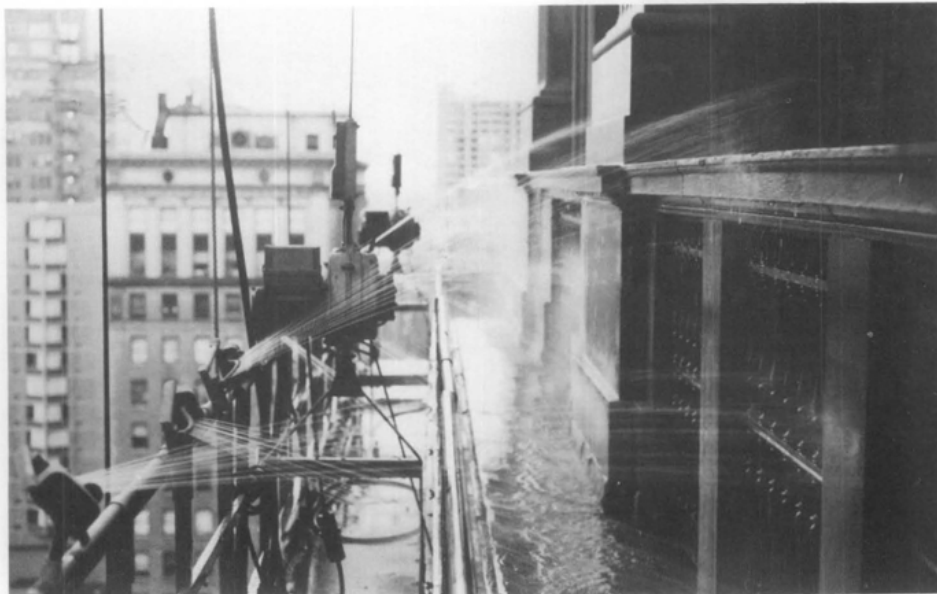
Figure 3. Close-up view of the oscillating sprinklers spaced 3 feet apart and connected to 1/4" PVC piping attached to the rear bar of each scaffold.

large amounts of water, and thus had to be completed well before there was a threat of freezing temperatures. This was to avoid the possibility of damage that might result from water freezing inside the saturated masonry, which would cause the stone to spall. In addition, the water to be used for the cleaning had to be analyzed to determine if it contained potentially harmful substances that might be introduced into the stone. Based on information obtained from the City of Philadelphia Water Department, it was determined that unfiltered city tap water could be used since it was sufficiently pure. This water has a pH of 8.2, and contains the following minor impurities, identified below in parts per million: