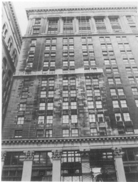
Figure 4. South Penn Square elevation after the completion of two drops from the 9th-4th floors of water soaking only, and prior to beginning the rinse process.