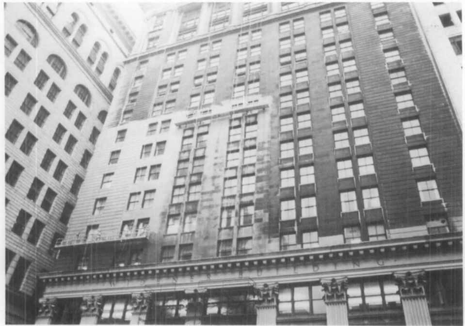
Figure 5. The drop on the left side of the building has been water-soaked and rinsed, while the drop on the right has been soaked only. Note the amount of soil that still remains on the right side before rinsing.

soaking had been completed on both drops (a "drop" is the amount of vertical wall surface that can be covered by one scaffold moving vertically up or down a building), the crew began the rinsing process this time moving down the elevation, starting from the 9th floor and proceeding to the 4th ( see figure 4 ).