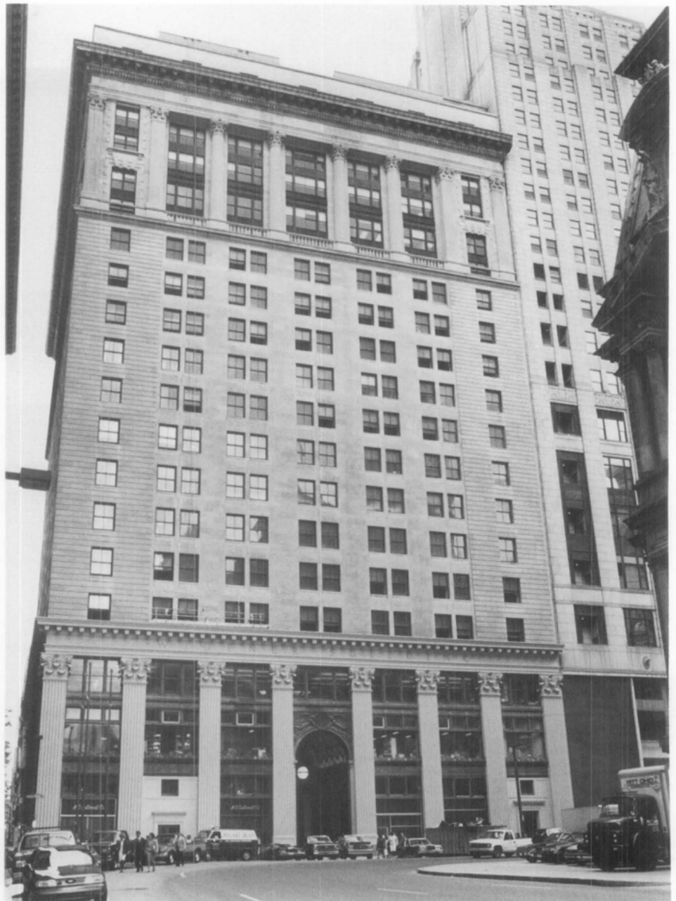
Figure 7. The South Penn Square elevation after its successful cleaning using the water soak method.

The cost of using the water soak method to clean the 100,000 square feet of limestone was approximately one-half the cost of chemical cleaning.