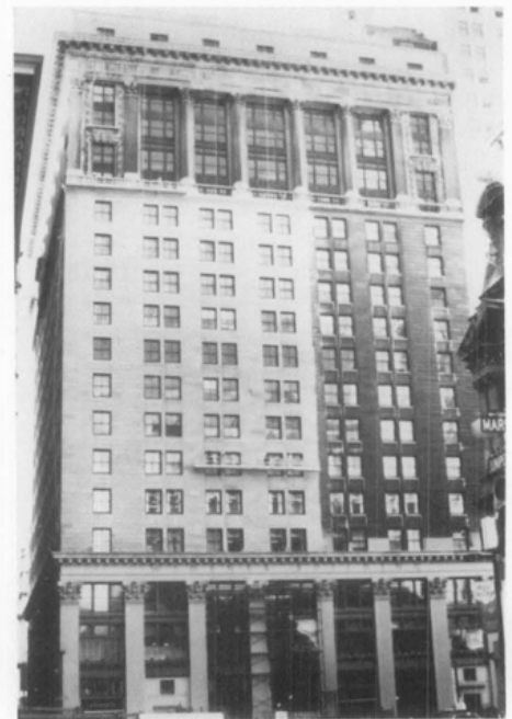
Figure 6. The contrast between the cleaned and the uncleaned portions of the facade after completion of both the water soak and the washdown rinse of these two drops from the 14th-4th floors is dramatic.

Water soaking is a cost-effective cleaning process for both large and small limestone buildings. The results of the cleaning of the Widener Building are startling, especially when compared to the appearance of the stone prior to the start of the project ( see figure 7 ). Although the cleaning team was on the job site for a longer