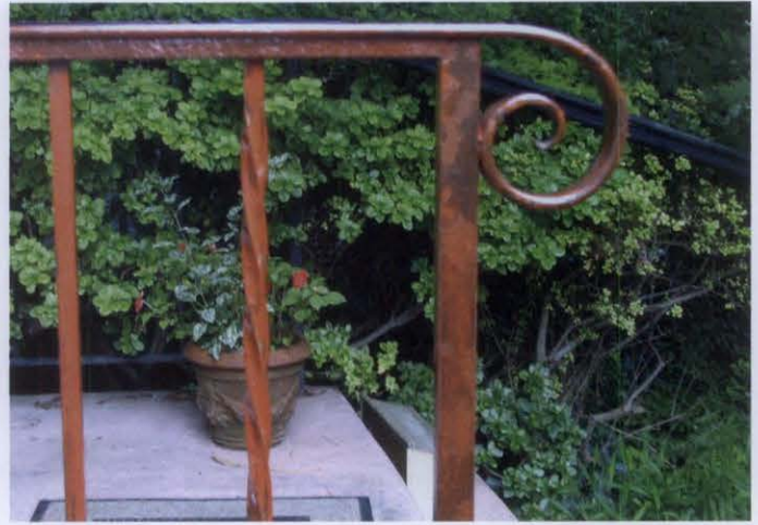
Figure 15. Metal projecting elements on a building, such as sign armatures and railings, are easily subject to rust and decay. Proper surface preparation to remove rust is essential. Special metal primers and topcoats should be used.

Prime and repaint features when necessary and repaint horizontal surfaces on a more frequent basis.