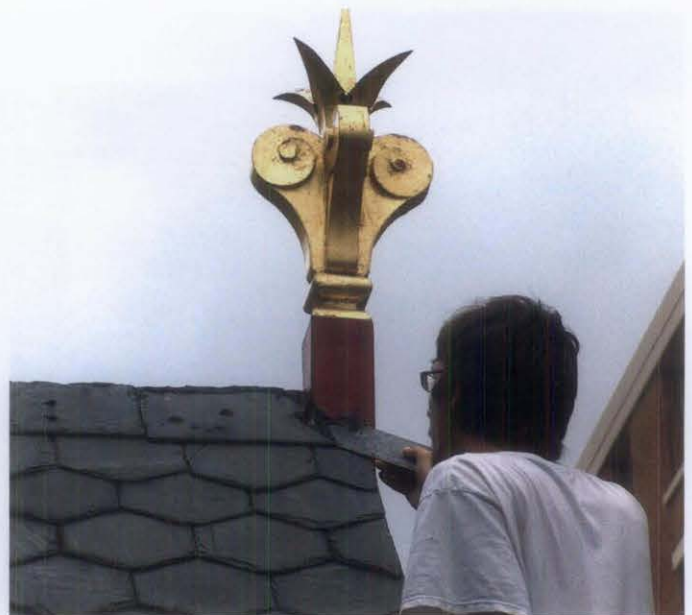
Figure 5. The use of a sealant to close an exposed joint is not always an effective long-term solution. Where this decorative wood element connects to the slate roof, the sealant has failed within a short time and a proper metal flashing collar is being fitted instead.