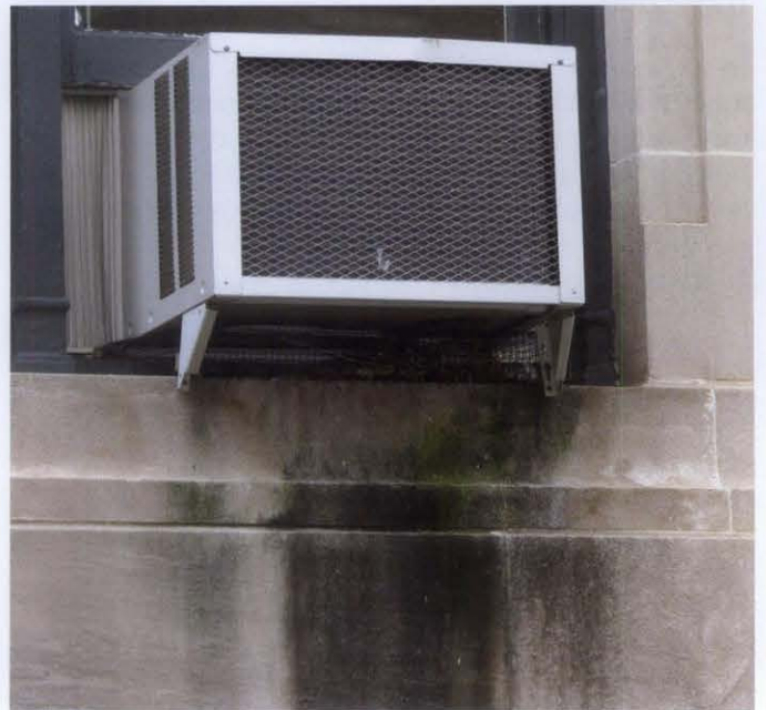
Figure 13. Window air conditioning units can cause damage to surfaces below when condensation drips in an uncontrolled manner. Drip extension tubes can sometimes be added to direct the discharge.