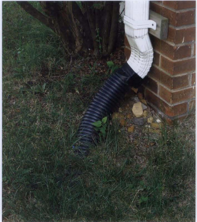
Figure 17. Extending downspouts at their base is one of the basic steps to reduce dampness in basements, crawl spaces and around foundations. Extensions should be buried, if possible, for aesthetics, ease of lawn care, and to avoid creating a tripping hazard.

Historic house journals, maintenance guides for older buildings, preservation consultants, and preservation maintenance firms can assist with writing appropriate procedures for specific properties. Priorities should be established for intervening when unexpected damage occurs such as from broken water pipes or high winds.