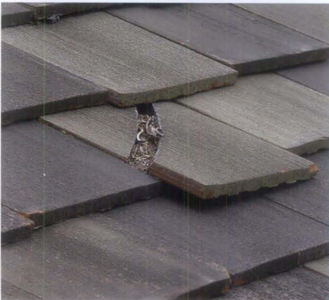
Figure 4. Damage to roofs often requires immediate attention. As a temporary measure, this damaged roof tile could be replaced with a brown aluminum sheet wedged between the existing tiles.