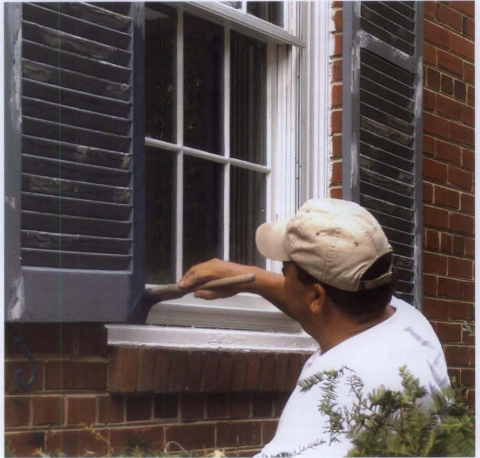
Figure 12. Good surface preparation is essential for long lasting paint. Scraping loose paint, filling nail holes and cracks, sanding, and wiping with a damp cloth prior to repainting are all important steps whether touching up small areas or repainting an entire feature. Always use a manufacturer's best quality paint. Windows and shutters may need repainting every five to seven years, depending on exposure and climate.

• Correct perimeter cracks around windows and doors to prevent water and air infiltration. Use traditional material or modern sealants as appropriate. If fillers such as lead wool have been used, new wool can be inserted with a thin blade tool, taking care to avoid damage to adjacent trim. Reduce excess air infiltration around windows by repairing and lubricating sash locks so that windows close tightly.