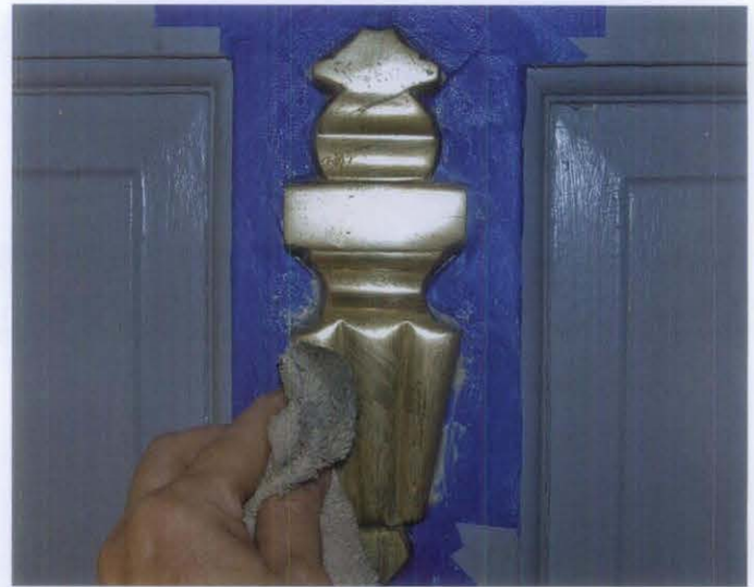
Figure 1. Maintenance involves selecting the proper treatment and protecting adjacent surfaces. Using painter's tape to mask around a brass doorknocker protects the painted door surface from damage when polishing with chemical compounds. On the other hand, hardware with a patinated finish was not intended to be polished and should simply be cleaned with a damp cloth.