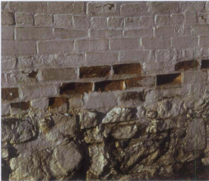
Figure 10. Repointing of masonry should usually be approached as repair rather than maintenance work in part because of the need for a skilled mason familiar with historic mortar. In this case, a moisture condition was not corrected and the use of a waterproof coating and off-the-shelf Portland cement mortar trapped water and resulted in further damage to these 19th century bricks.

one coat of primer and coat end grain that might be exposed with two coats of primer.