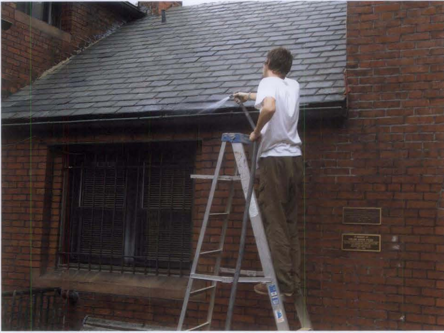
Figure 3. Keeping gutters clean of debris can be one of the most important cyclical maintenance activities. On this small one-story addition, a garden hose is being used to flush out the trough to ensure that the gutter and downspouts are unobstructed. Gutters on most small and medium size buildings can be reached with an extension ladder and a garden hose.

Depending on the nature of the roof, some common conditions of concern to look for are: