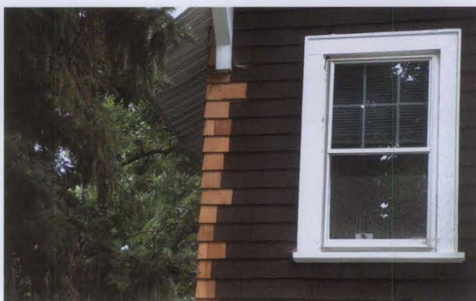
Figure 7. One of the advantages of wood shingles as a wall covering is that individual shingles that are damaged can easily be replaced. On this highly exposed corner, worn shingles have been selectively replaced to help safeguard against water damage. The new shingles will be stained to match the existing shingles.