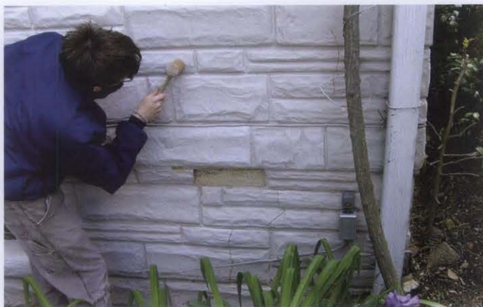
Figure 6. Stucco applied to an exterior wall or foundation was intended to function as a watertight surface. Unless maintained, rainwater will penetrate open joints and cracks that may occur over time. A spalled section of stucco indicates some damage has occurred and a wooden mallet is being used to tap the surface to determine whether the immediate stucco has lost adhesion.

• Wash exterior wall surfaces if dirt or other deposits are causing damage or hiding deterioration; extend