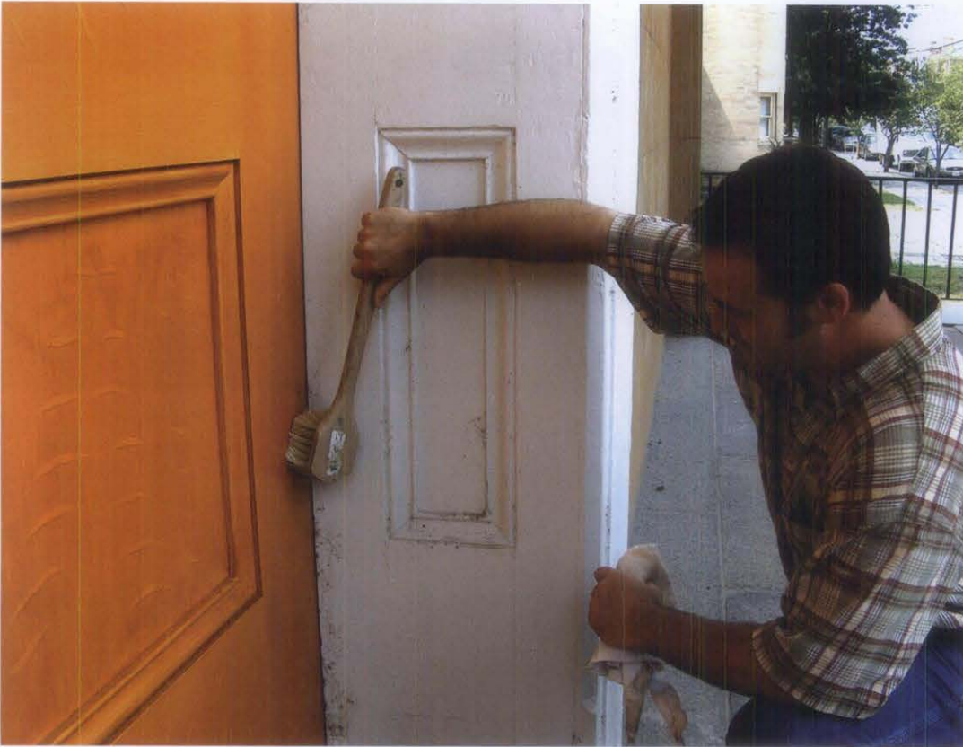
Figure 9. To help extend a repainting cycle, dirt and spider webs should be removed before permanent staining occurs. In this case, a natural bristle brush and a soft damp cloth are being used to remove insect debris and refresh the surface appearance.

scheduled times for cleaning for cosmetic purposes to reduce frequency (Fig 9). When cleaning, use the gentlest means possible; start with natural bristle brushes and water and only add a mild phosphate-free detergent if necessary. Use non-abrasive cleaning methods and low-pressure water from a garden hose. For most building materials, such as wood and brick, avoid abrasive methods such as mechanical scrapers and high-pressure water or air and such additives as sand, natural soda, ice crystals, or rubber products. All abrasives remove some portion of the surface and power-washing drives excessive moisture into wall materials and even into wall cavities and interior walls. If using a mild detergent, two people are recommended, one to brush and one to prewet and rinse. When graffiti or stains are present, consult a preservation specialist who may use poultices or mild chemicals to remove the stain. If the entire building needs cleaning other than described above, consult a specialist.