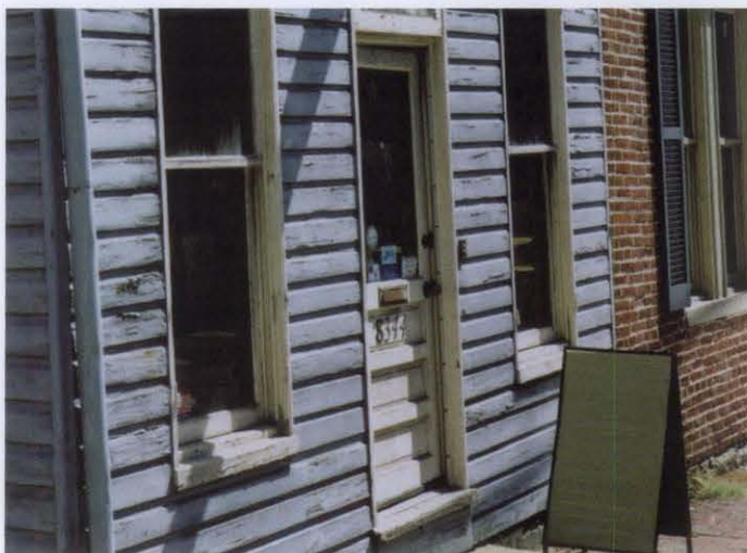
Figure 8. The paint on the siding of this south-facing wall needs to be scraped, sanded, primed and repainted. Postponing such work will lead to further paint failure, require greater preparatory costs, and could even result in the need to replace some siding.