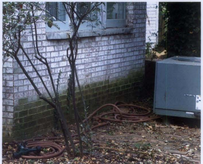
Figure 16. This chronically wet area has a mildew bloom brought on by heat generated from the air-conditioning condenser unit. The dampness could be caused by a clogged roof gutter, improper grading, or a leaking hose bibb.