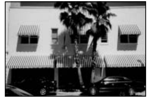
Rehabilitated 1920s commerical building.

Application 2 ( Incompatible treatment , later corrected to meet the Standards ): Another two-story vernacular masonry commercial building, also dating from the 1920s, that features three, one-bay storefronts on the first floor was rehabilitated for continued use as a restaurant and bar with rental apartments on the second floor. The original, historic storefronts had been replaced in the 1950s with aluminum frame windows and doors. Although, the Standards would also have allowed these later storefronts to be retained in the rehabilitation, the owner chose to install a new wood storefront with a simple, contemporary design, compatible with the building's historic character. However, the replacement wood doors had