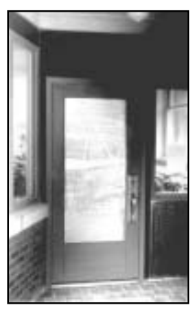
Appropriate replacement door.

The storefront windows were replaced with simple, contemporary windows with dark-colored frames that were compatible with the historic building. But the "stock" white entrance door with its nine-pane glass and snap-in muntins above two vertical panels was not compatible with the historic building. In order to bring the project into compliance with the Standards, remedial work involved replacing the stock door with a simple glazed wood door that was compatible in both design and color with the historic building.