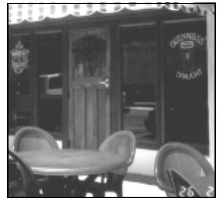
Rehabilitated storefront with incompatible stained glass door.

Application 3 ( Incompatible treatment ): In a third project, a two and one-half story Foursquare house with Colonial Revival-style details built in the first decade of the 20th century was rehabilitated for continued residential use. Although most of the interior finishes and features, including all lath and plaster, had been removed by a previous owner, the original front door still remained. In the course of the rehabilitation, however, this historic door was replaced with a new door featuring multi-paned glass with two vertical panels below, the same "stock" door, in fact, that was used in the dairy conversion project. This multi-paned door is no more compatible with the character of this early-20th century house, than it was with the 1920s dairy building. To meet the Standards, the