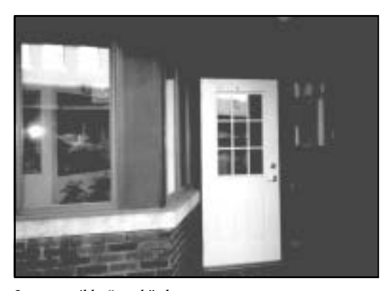
Incompatible "stock" door.

The storefront windows were replaced with simple, contemporary windows with dark-colored frames that were compatible with the historic building. But the "stock" white entrance door with its nine-pane glass and snap-in muntins above two vertical panels was not compatible with the historic building. In order to bring the project into compliance with the Standards, remedial work involved replacing the stock door with a simple glazed wood door that was compatible in both design and color with the historic building.