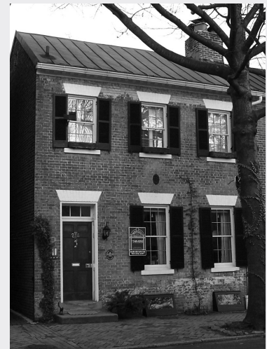
The photo above depicts the building for which this fictional application was created.

Complete these boxes until all aspects of your project are fully described. Be sure to include details like proposed finishes (drywall, plaster, etc.) and planned methods of repair.