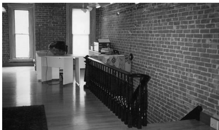
Loss of historic character: The original finished walls and all separations between rooms and hallway have been lost to create an open floor plan, causing this project not to qualify for tax credits.

To learn more about the Standards , visit the National Park Service website at www.nps.gov/history/hps/tps/ or contact your State Historic Preservation Office (SHPO)