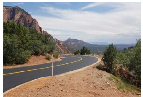
Kolob Canyon Road at Zion National Park after pavement preservation treatment.