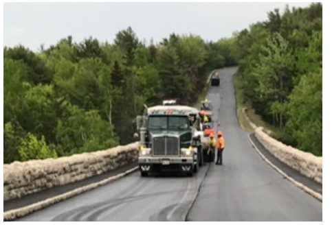
Typical mill and overlay pavement preservation treatment at Acadia National Park.