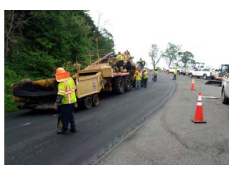
Pavement preservation treatment at Shenandoah National Park.