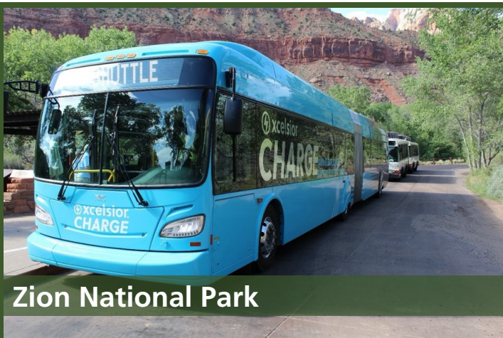
Zion National Park

The NPS is replacing Zion National Park's aging transit fleet with one of the largest battery electric bus purchases in North America. The fleet electrification will help the park reduce greenhouse gas emissions, improve air quality, reduce noise, and save on operating costs.