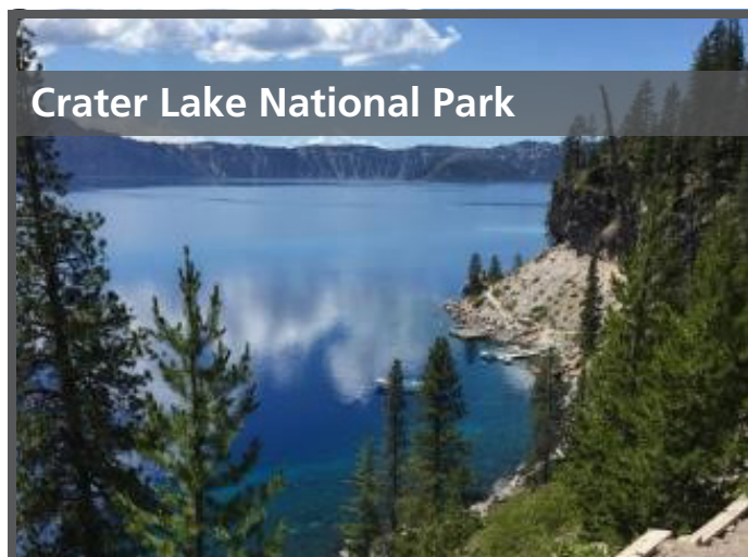
Crater Lake National Park

Providing active transportation opportunities and keeping pedestrians and bicyclists safe are NPS priorities. The Cleetwood Trail at Crater Lake National Park requires investment to address critical safety issues and maintenance needs , including mitigating nine unstable slopes, reconstructing the trail retaining walls, grades, and cross slopes to make the trail level and stable, and rehabilitating the failing bulkhead and floating docks at the marina.