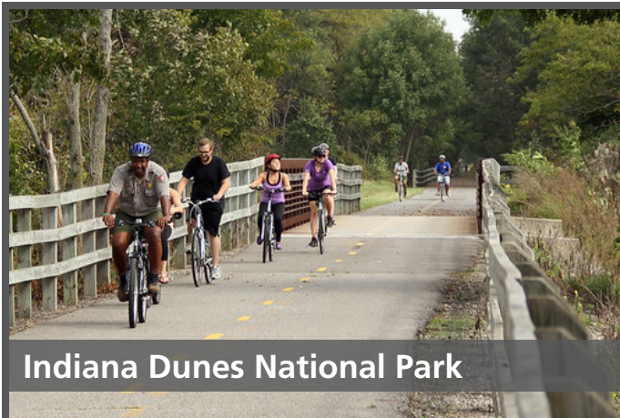
Indiana Dunes National Park