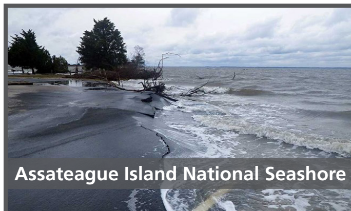
Assateague Island National Seashore

Climate change has increased the frequency of extreme weather events and natural disasters, severely impacting transportation systems and facilities on public lands, such as this parking lot at Assateague Island National Seashore. The NPS has conducted over 20 vulnerability assessments and found that access roads and other transportation infrastructure are highly vulnerable to coastal hazards and sea-level rise .