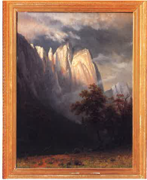
CATHEDRAL ROCK, 1870. ALBERT BIERSTADT (1830-1902), SIGNED AND DATED LOWER RIGHT. COLLECTIONS OF MARY F. AND LAURANCE S. ROCKEFELLER, WOODSTOCK, VERMONT.