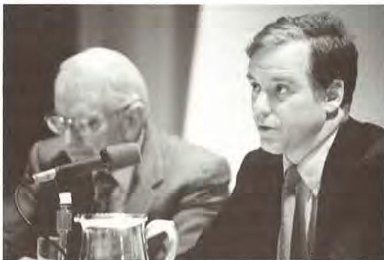
LAURANCE SPELMAN ROCKEFELLER, GOVERNOR HOWARD DEAN