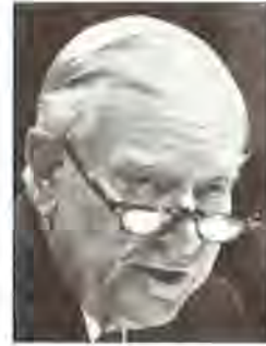
RUSSELL E. TRAIN

It is a privilege to join with you in exploring the history and evolution of conservation stewardship in America as illustrated by the lives of George Perkins Marsh, Frederick Billings, and Laurance S. Rockefeller; and particularly as these are manifested here through Marsh-Billings National Historical Park.