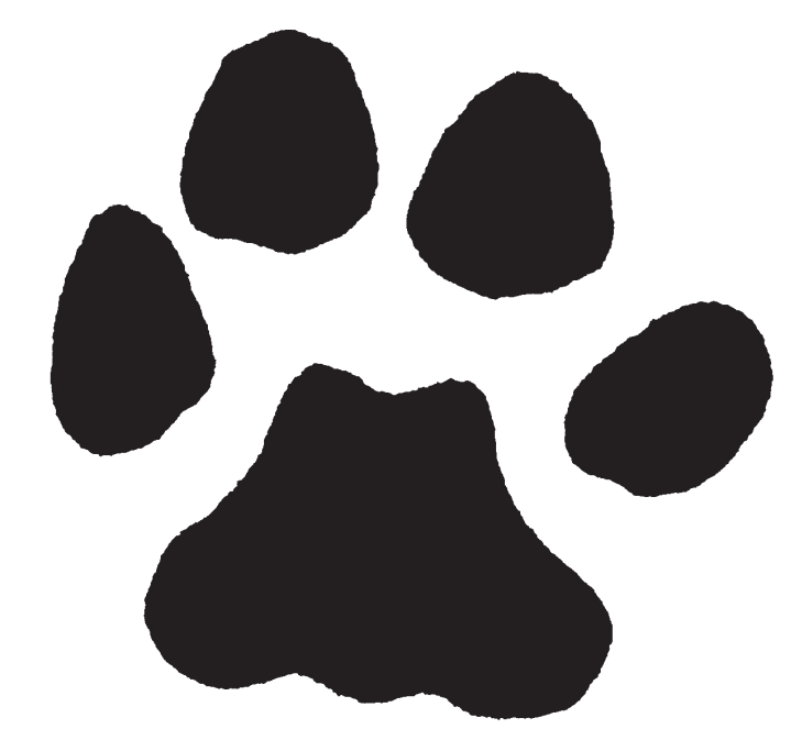
Life-sized cougar front paw track

The cougar, also called mountain lion, puma, or panther, once ranged across North America and from Canada to the tip of South America. Its scientific name, Felis concolor , means "cat of one color," which is usually tawny gray or reddish-brown with black markings on the face, ears and tip of the tail. Young kittens have black spots. Adult males can be over eight feet long (including nearly three feet of tail!) and can weigh over 150 pounds; females weigh about 90 to 110 pounds. An adult cougar's front paw track is about 3½ inches across, with rear paw tracks slightly smaller.