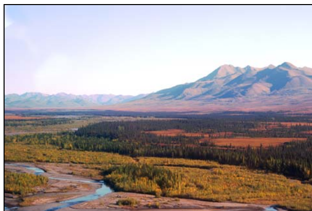
Aerial view of Eli River drainage in Noatak National Preserve during peak fall colors.