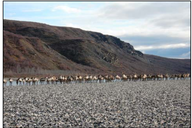
Caribou getting ready to cross the Noatak river, heading south in the fall.