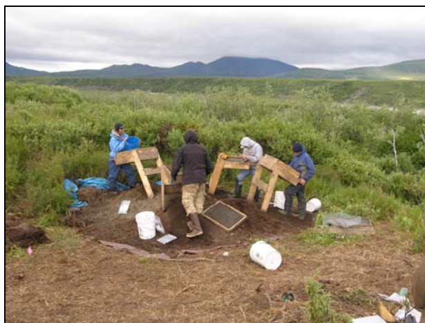
Archeological investigations in Noatak National Preserve during summer 2006.