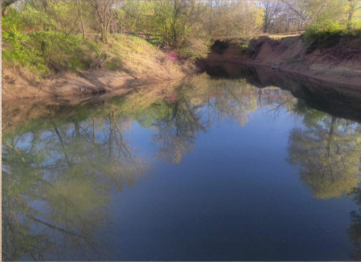
Camden Oliphant “Reflections” Photography