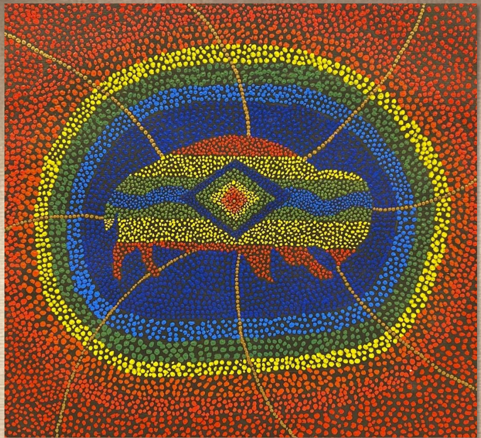
Isaac Kemp “Yanash” Acrylic Paint