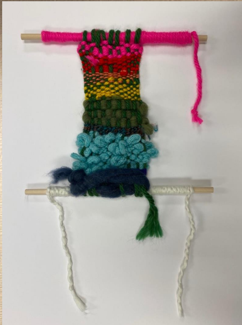
Peyton Horton "When I'm Weft Alone" Textile