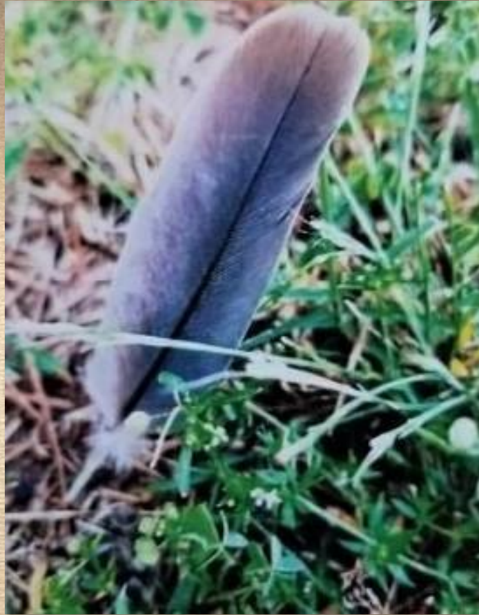
Lazarus McFerran “Foshi’ Hisi” Photography