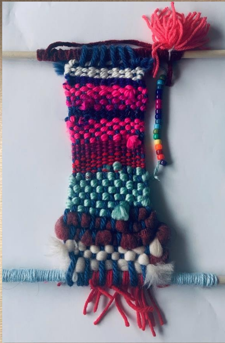
Lila Willis “Nakbatiipoli” Textile