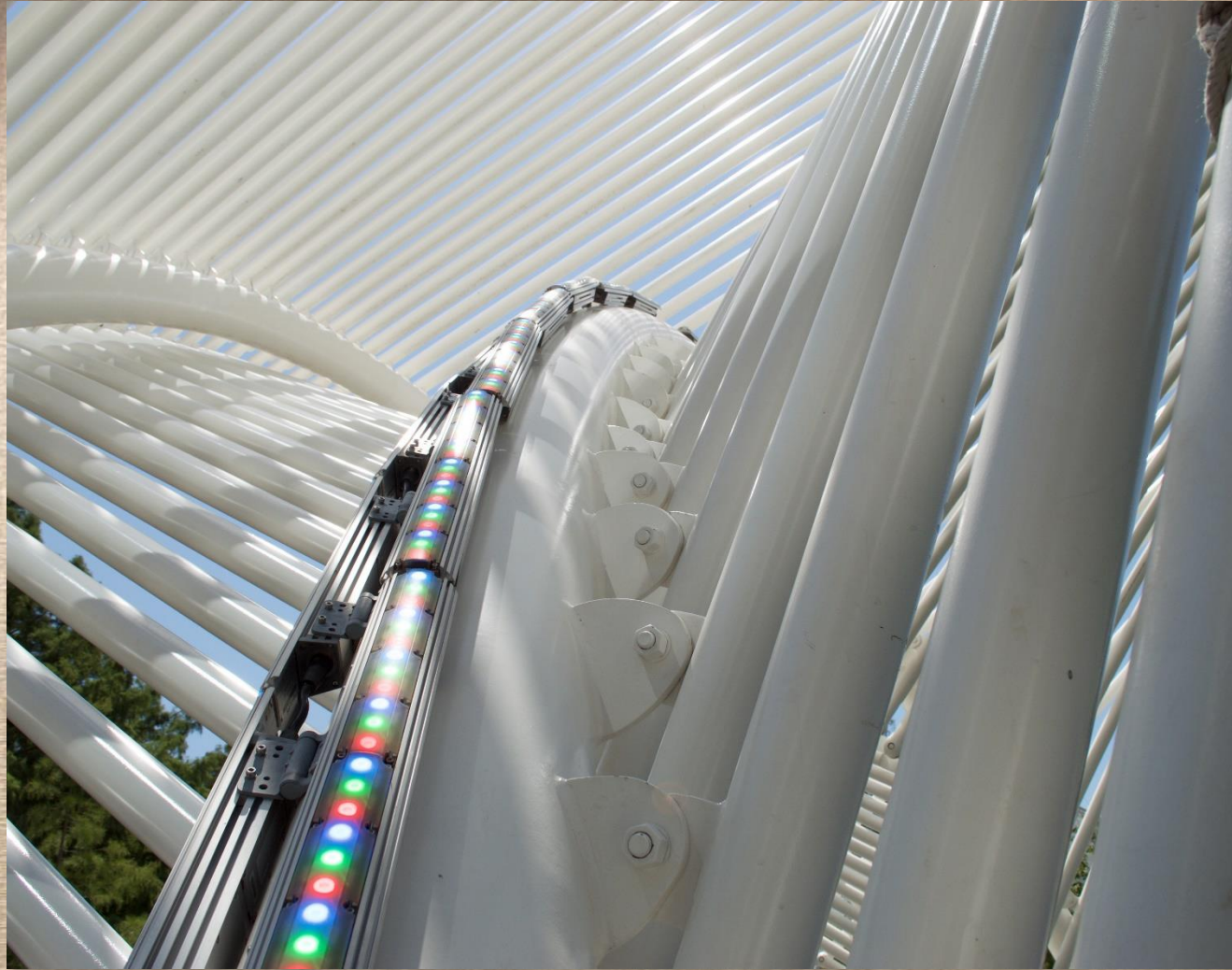
Xylan Wallace “Patterns” Photography