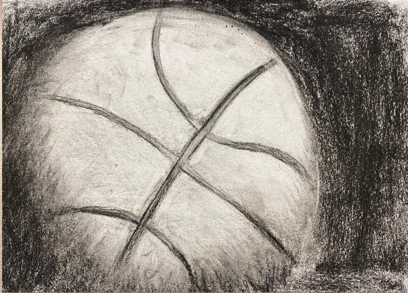
Shae Bittle “Basketball” Charcoal