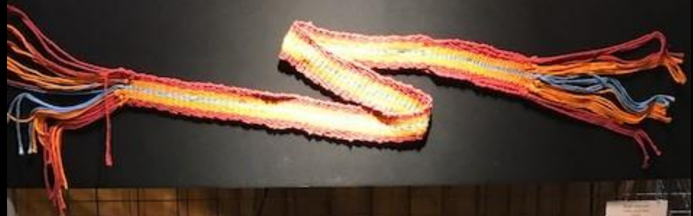
Chickasaw Youth Art

National Park Service U.S. Department of the Interior Northern Plains Region American Indian Heritage Month: Chickasaw Youth Art The Chickasaw Nation embraces the creative side of the human spirit by supporting fine arts. This exhibit is artwork by talented young people from the Chickasaw Nation in Oklahoma who have attended some of our nation's art programs. 2019-2020