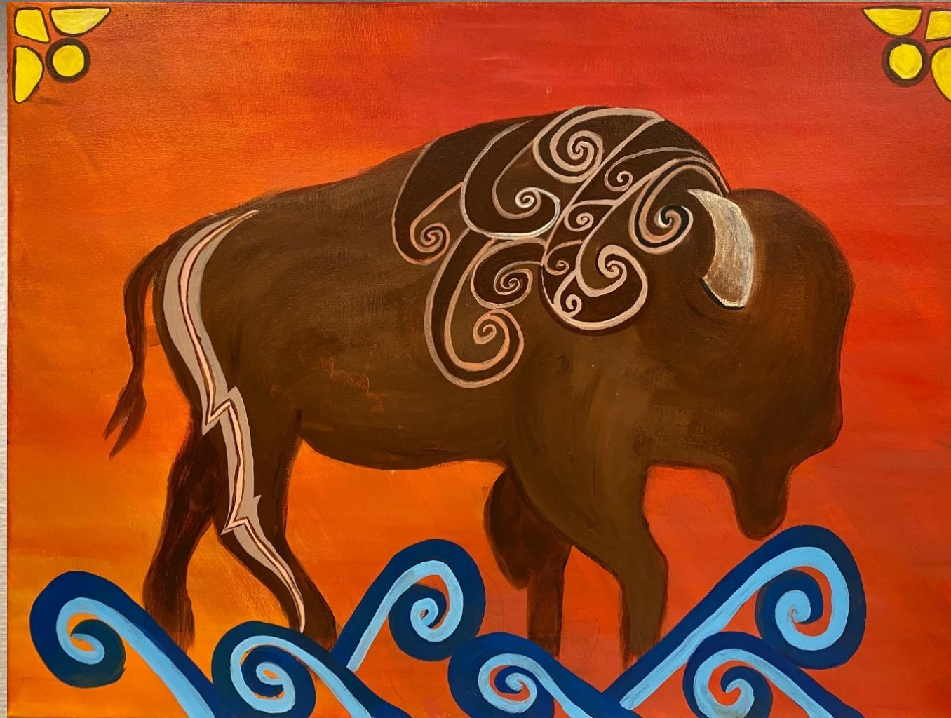
Micah Postoak “Buffalo in Water” Acrylic Paint