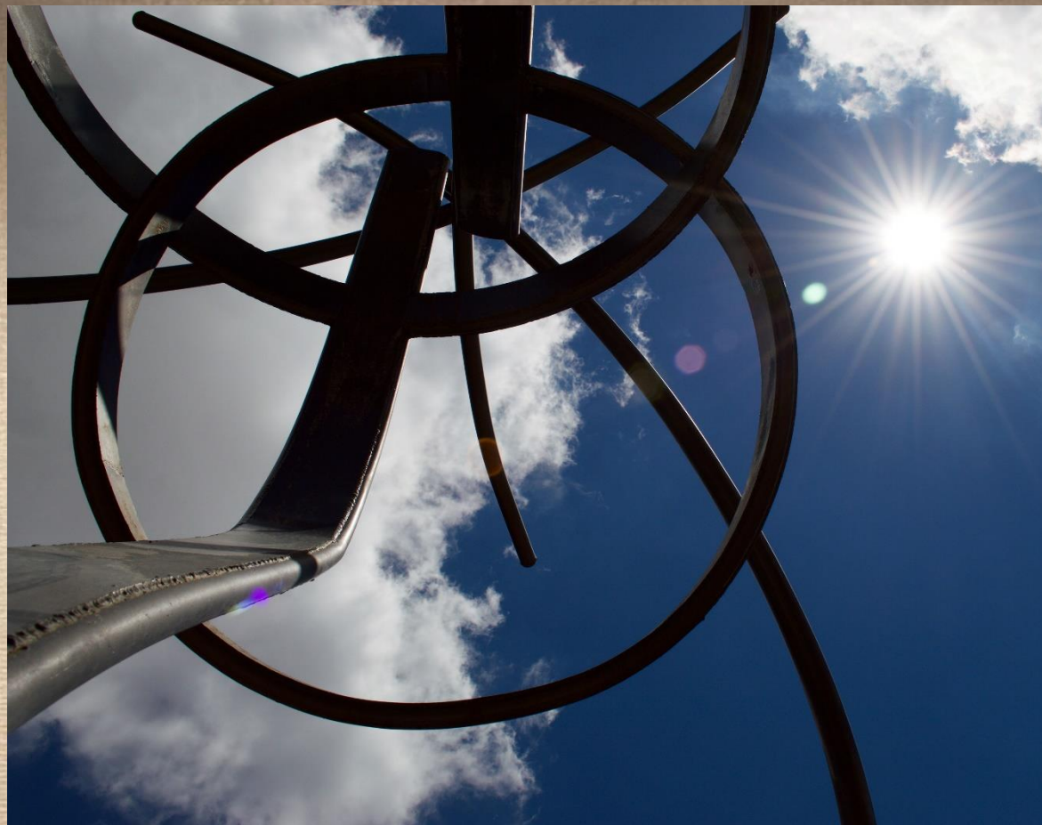
Xylan Wallace “Unity” Photography