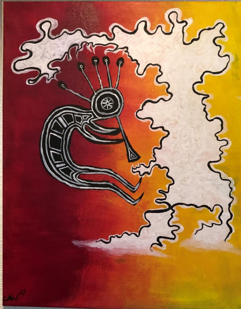
Logan Heldenbrand "Kokopelli's Song" Acrylic Paint