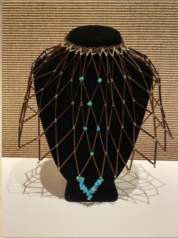
Sophie Mater “Beaded Collar” Beading