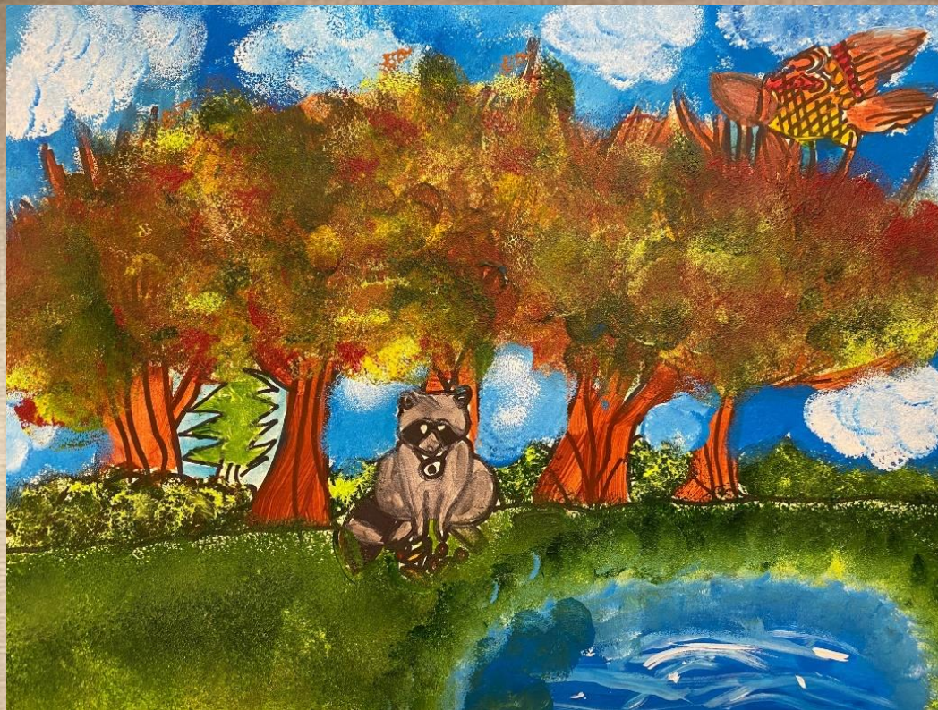
Jadyce Burns “Shawi” Acrylic Paint