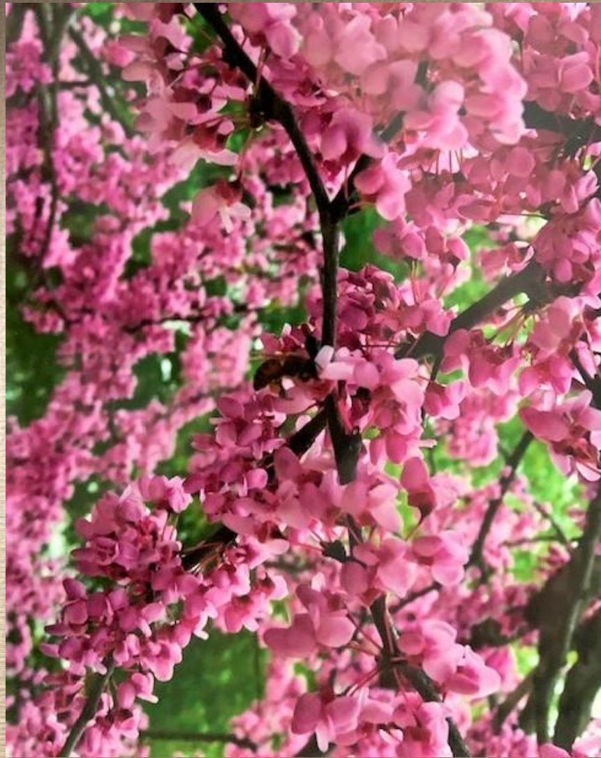
Drennon Jesse “Redbuds in Bloom” Photography