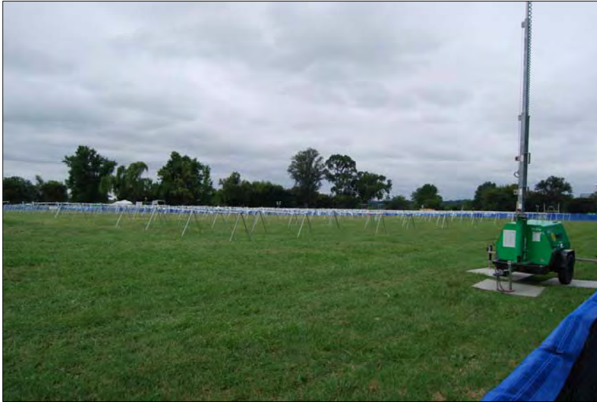
Setup for the National Triathlon in West Potomac Park.