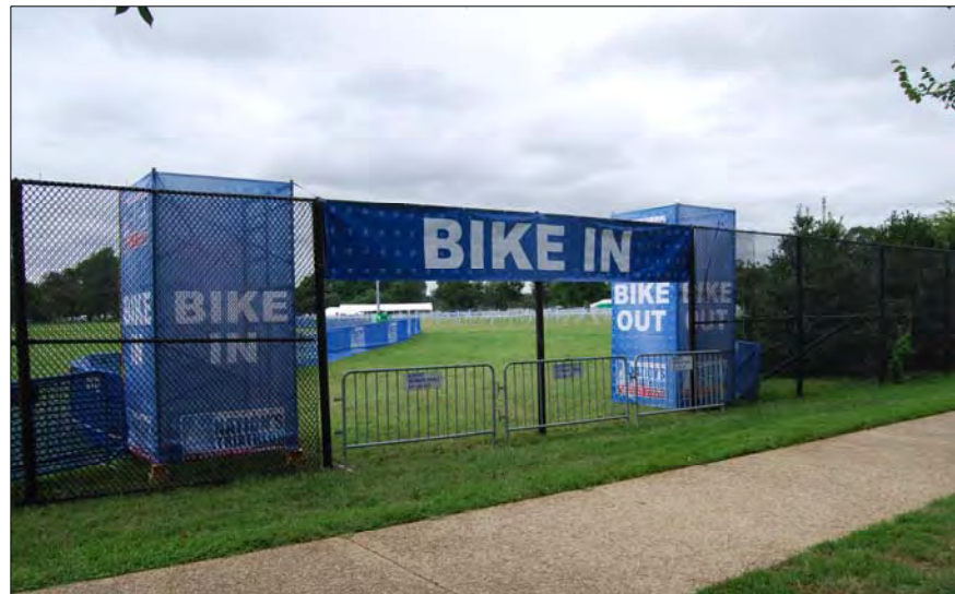
Extensive temporary fencing was used to separate different parts of the event.