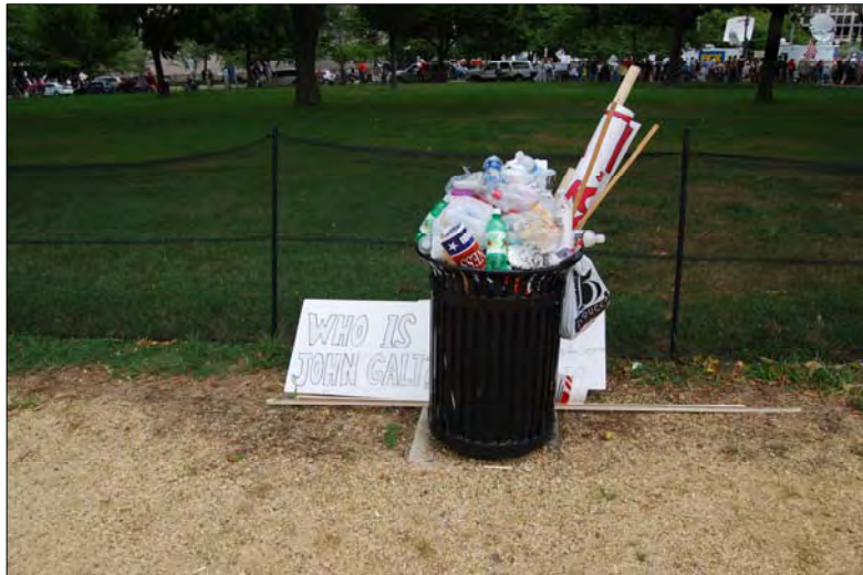
Routine maintenance operations for the National Park Service include removing additional trash after demonstrations.