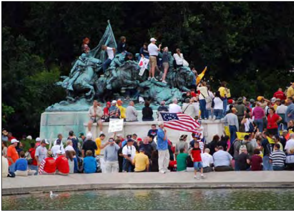
Demonstrations usually last for a few hours, with minimal impacts on turf areas.