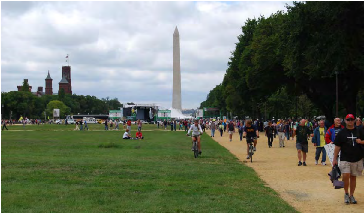
The National Mall is frequently the site of multiple events at the same time. On September 12, 2009, a First Amendment demonstration on the west grounds of the U.S. Capitol overflowed into Union Square and onto the Mall, while the Black Family Reunion was setup on the Mall in front of the Smithsonian Castle.