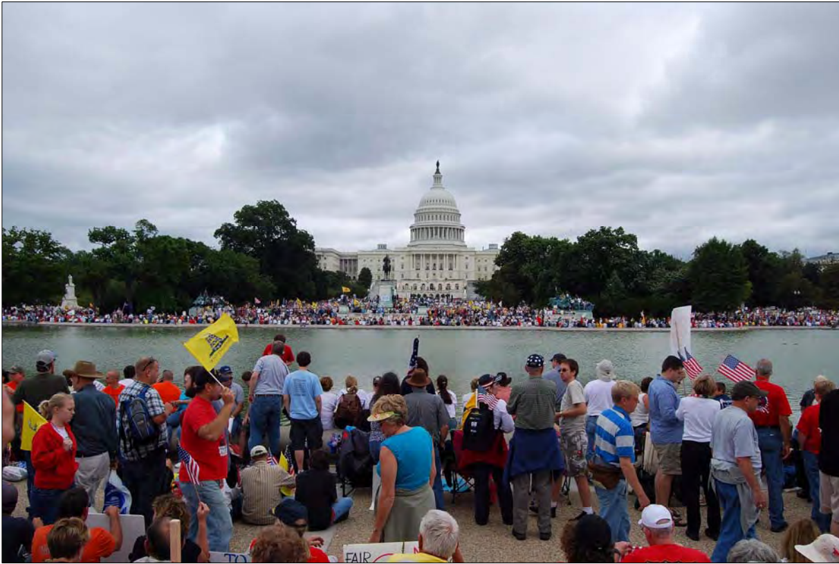
First Amendment demonstrations are an essential purpose of the National Mall and will continue. Here a demonstration on the west grounds of the U.S. Capitol extends into Union Square.