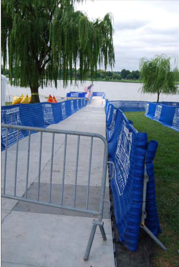
A walkway and temporary fencing provide access to a dock for the third part of the triathlon.