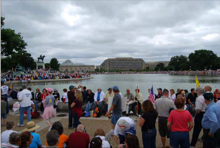
The size of the Capitol Reflecting Pool affects how Union Square can be used.