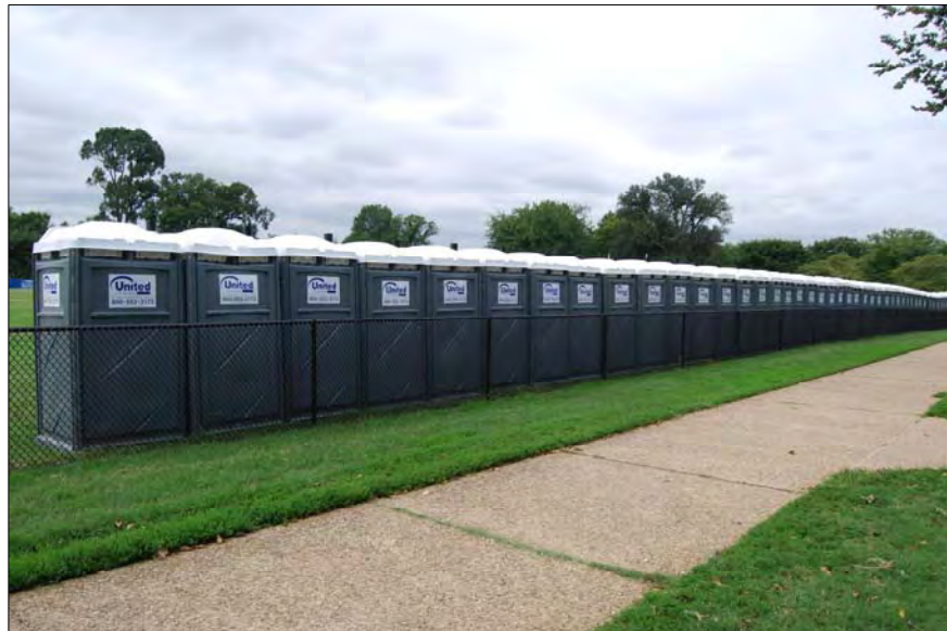
Hundreds of portable toilets were brought in for attendees.