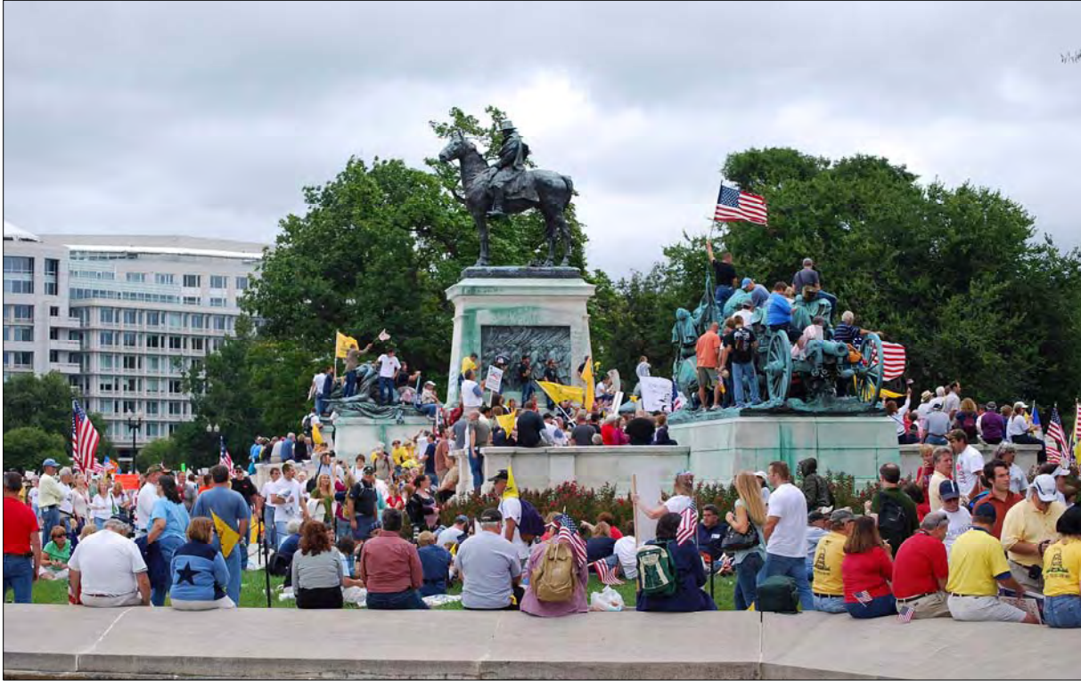
Protecting memorials during events is a concern.