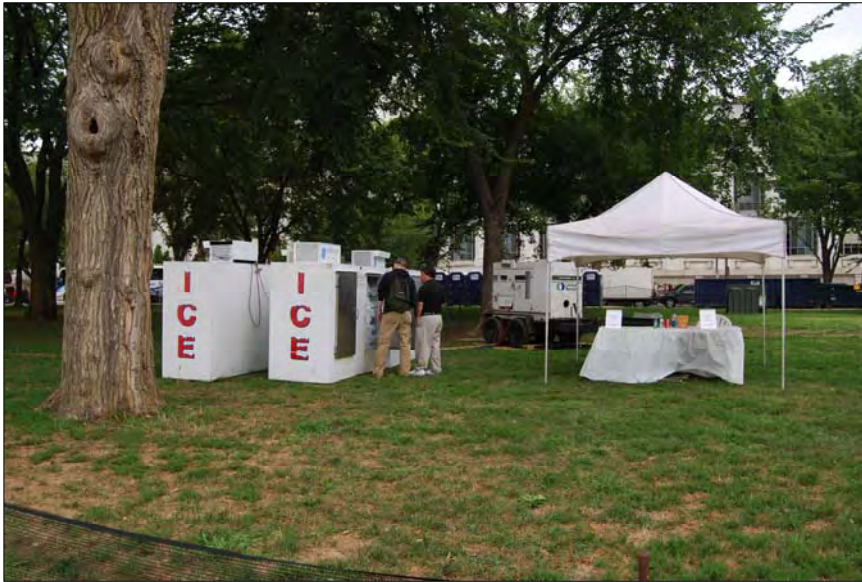
The elm tree panels have been used for event infrastructure.