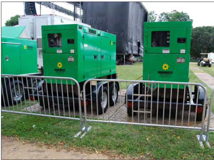
Rubber matting is intended to help reduce soil compaction by more evenly distributing weight.