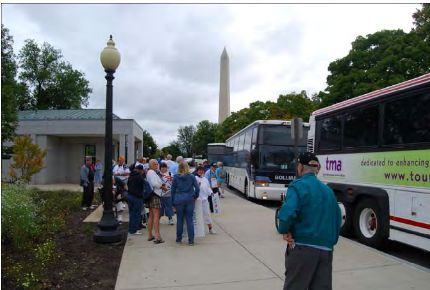
Access during large demonstrations is always a logistical challenge. Here people participating in a demonstration at the U.S. Capitol are unloading at the World War II Memorial.