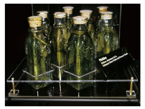
Figure 3. Square bottles in a customized a crylic restraining shelfing shelf.

Line the cut-outs with moleskin to prevent abrasion to the object. Shelves can be fabricated by specialized mount-making firms that handle acrylic sheeting, or by museum staff proficient in cutting acrylic sheeting.