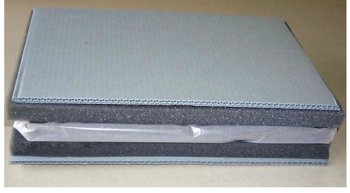
Figure 4. Sandwich the foam package between two layers of multi-use corrugated board.

Secure all the layers together. Cut 1-1/2" wide strips of folder stock and extend around the edges of the stacked layers. Continue with the strips approximate 2"