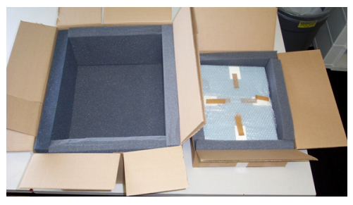
Figure 8. Outer box prepared to receive inner box.

• Place the prepared box into another box lined with 2" of urethane foam on all four sides and bottom. If there still are void areas, fill with additional urethane foam and place a sheet of foam on top. This process is called double boxing. This provides additional protection from shock and vibration (see figures 7 - 9).