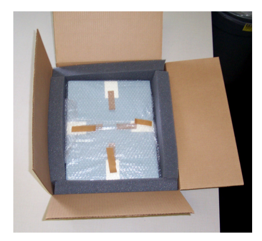
Figure 7. Prepared frame in inner box.

the box with 2" of urethane foam on all four sides and bottom. If there are void areas, fill with additional urethane foam and place a sheet of foam on top. Tape the flaps of the box closed.