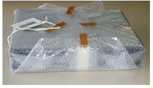
Figure 6. Tape an identification tag on top of the bubble wrap.

• Wrap in bubble wrap. Place the layered object in the middle of the bubble wrap. Pull the edges of the bubble wrap onto the object. Do not roll it onto the bubble wrap. Trim the excess or fold it under. Use masking tape to secure. Fold one end of the masking tape with adhesive surfaces together to form a pull tab. Tape an identification tag on top of the bubble wrap (see figure 6).