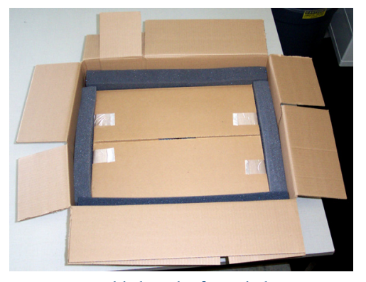
Figure 9. Double box the framed object.

• Enclose the appropriate paperwork. Seal the outer box with reinforced tape. Adhere at least three pieces of tape across the top of the box extending approximately 4-6" down each side (see figure 10).