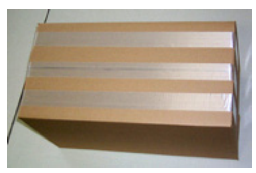
Figure 10. Adhere with three pieces of tape across the top of the box.

• Enclose the appropriate paperwork. Seal the outer box with reinforced tape. Adhere at least three pieces of tape across the top of the box extending approximately 4-6" down each side (see figure 10).