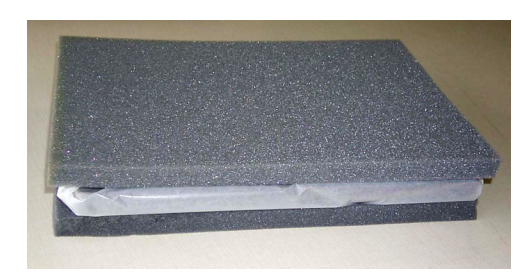
Figure 3. Sandwich the glassine-wrapped frame between urethane foam.

• Prepare the next protective layer. Cut 2 pieces of urethane foam and 2 pieces of multi-use corrugated board, measuring ½" larger than each side of the frame. When you have a deep frame, use packing materials to fill in the area so it is level with the top of the frame. Use a piece of urethane foam, polyester batting, or folded bubble wrap. Sandwich the glassine-wrapped frame between the urethane foam (see figure 3) and the multi-use corrugated board (see figure 4).