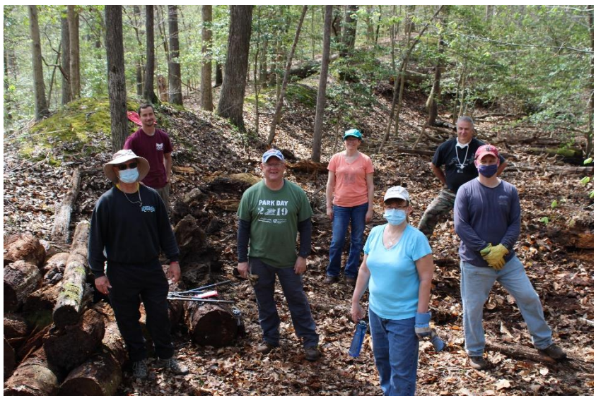
Above: Volunteers from the first Park Day shift pose in front of the newly cleared dumpsite at Gaines' Mill.

April 10 marked the American Battlefield Trust's 25 th Park Day, an event where volunteers come together across the nation to preserve and maintain battlefield sites. 10 volunteers worked in two shifts at Gaines' Mill to clean up an abandoned dump site and remove agricultural fencing from the woods. With these projects complete, we're one step closer to restoring the historic landscape of this battlefield.