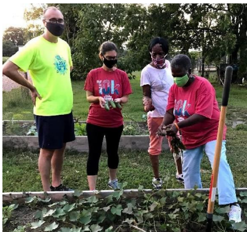
Left: Volunteers at work in the community garden.

On July 10, we'll be working with the City of Richmond to coordinate a service project in honor of Mrs. Walker's birthday. In addition, park staff are putting together a program for a virtual celebration on Mrs. Walker's actual birthdate, July 15. Volunteers welcome and needed!