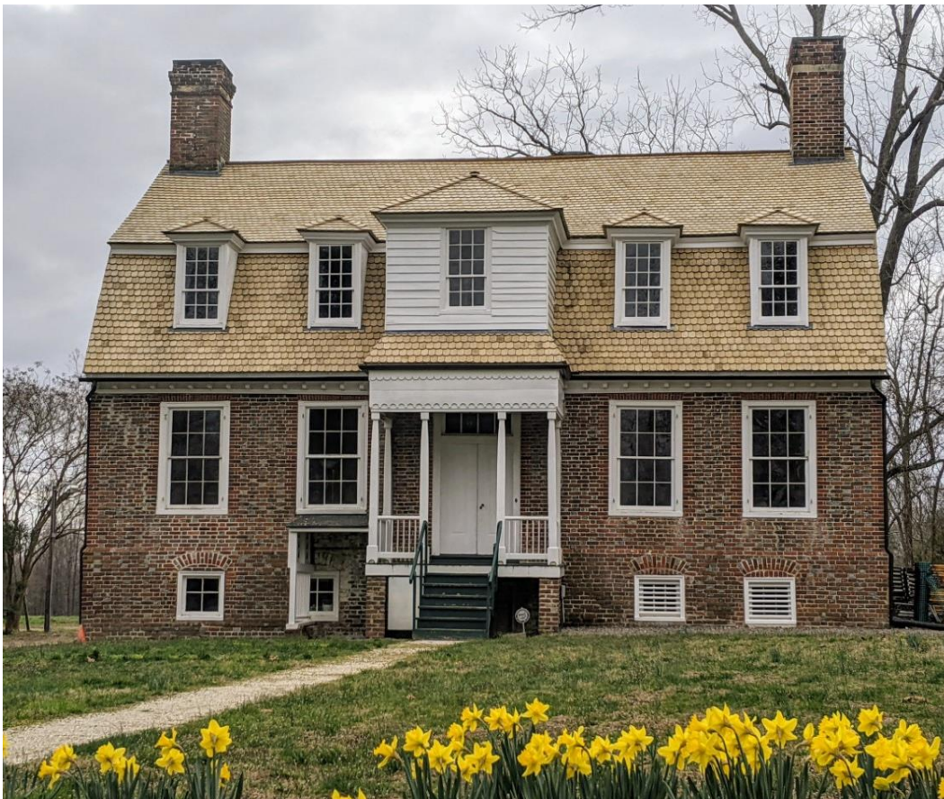
Left: Shelton House's new roof! Featuring a glimpse of spring daffodils.

summer. When finished we will be better poised to meet the needs of visitors and ensure that our parks are reaching wider audiences.