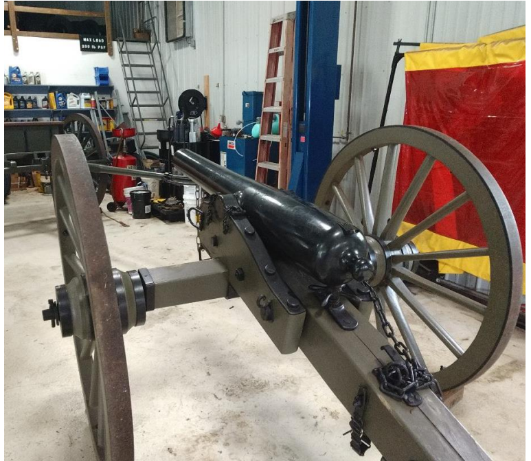
Above: The fully repaired cannon.