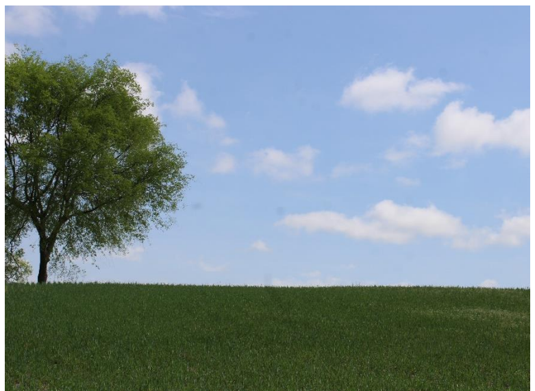
Right: Scenic blue skies and green fields at Gaines' Mill in April. Take some time to enjoy the outdoors this spring!