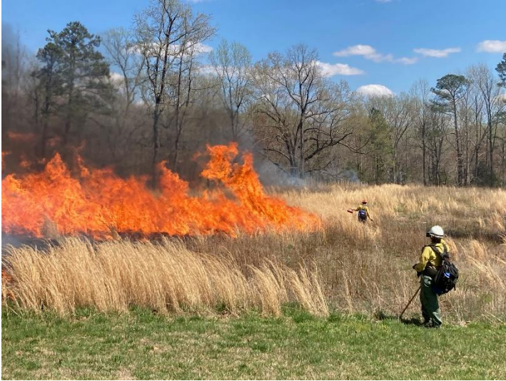
Above: Firefighters carefully observe the prescribed burn at Malvern Hill.