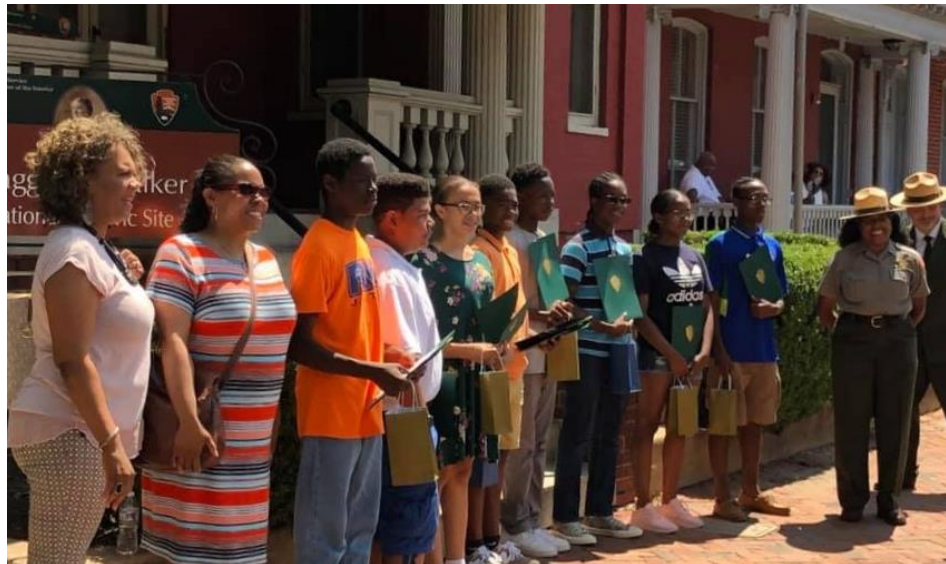
Above: Teachers, students, and park staff gather outside the Walker House at the completion of the 2019 Youth Leadership Institute.