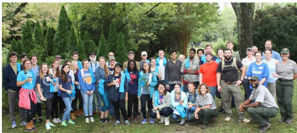
Above: Volunteers and staff at our first BioBlitz in 2016.

We'll be working with professors, naturalists, and citizen scientists to document biodiversity in meadow habitats at Malvern Hill. This will be the park's third BioBlitz, focused on cataloging plants, insects, herptiles, and mammals. We're still seeking volunteers!