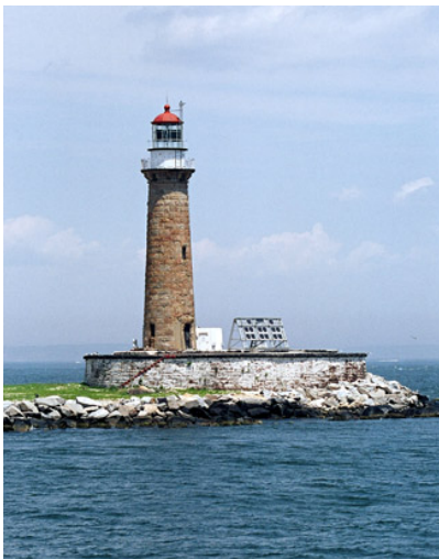
Little Gull Island Light