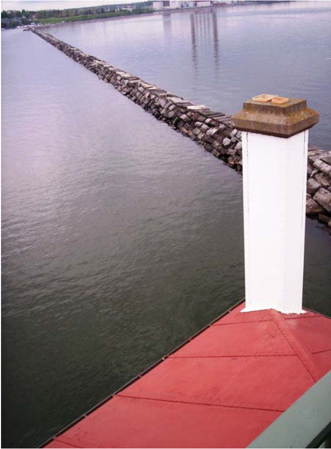
2,000 ft breakwater leads to lighthouse; steel plated chimney on Northwest light corner