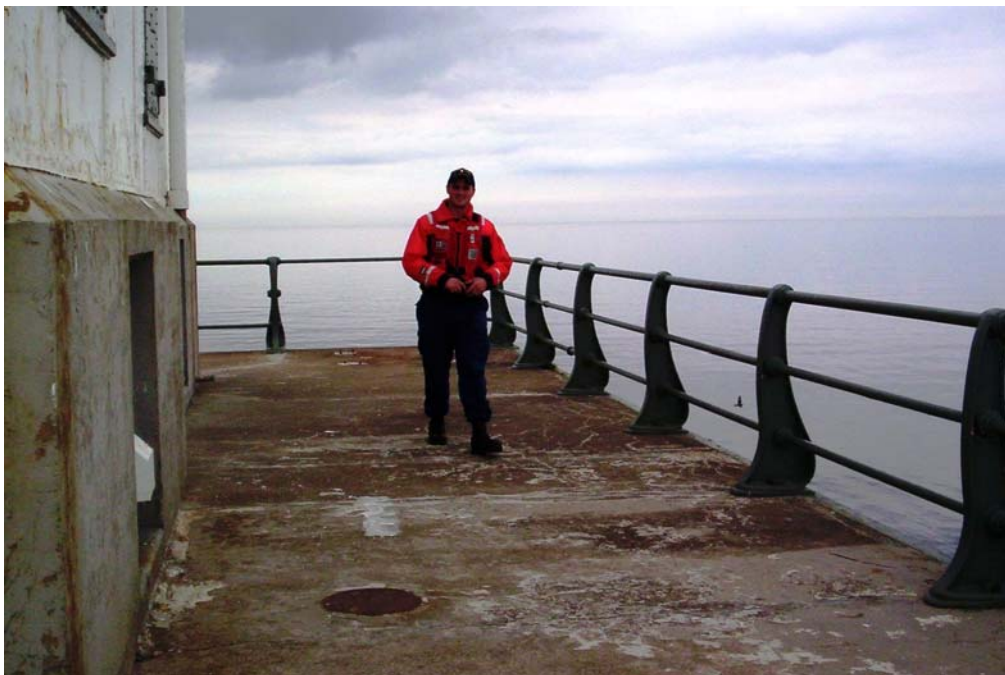
Approximately 12' wide, wrap-around, "terrace-like" deck enclosed by steel railings