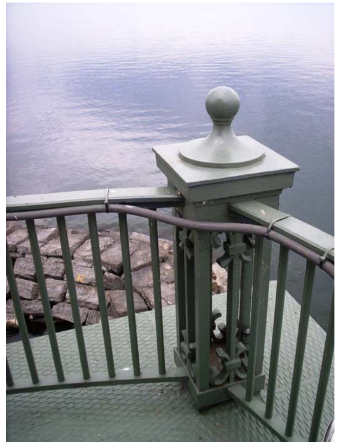
Architectural detail on the lantern/watch deck