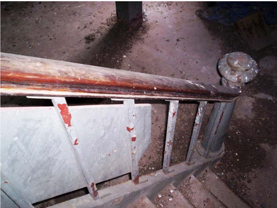
Varnished hardwood banister highlighting steel stairs leading from basement to living quarters