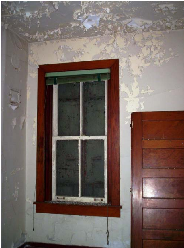
Varnished hardwood trimmed window and hardwood doors, preserved through used of steel shutters on all windows