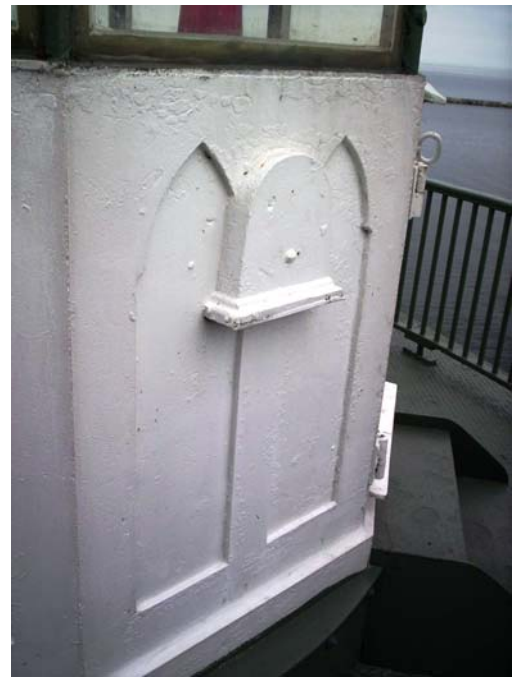
Architectural detail on the lantern/watch deck