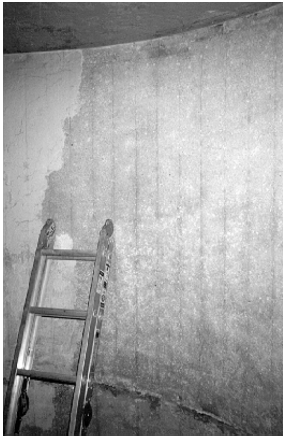
Figure 24. The interior paint was effectively removed using needle gun scalers, without damaging the concrete as evidenced by the visible impressions of the formwork boards.

*This product will cure in 99% humidity; this facilitated application during fog and misting weather.