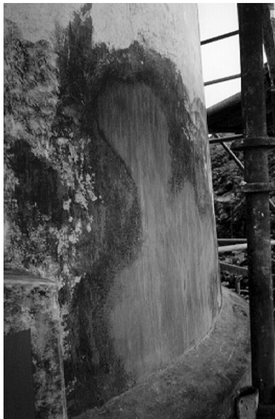
Figure 27. The areas where the loose mortar finish coat was removed were repaired with a two-part mortar patch. The final texture on the patch was tooled to match the historic wall surface. The patch was completely invisible after the tower was painted.