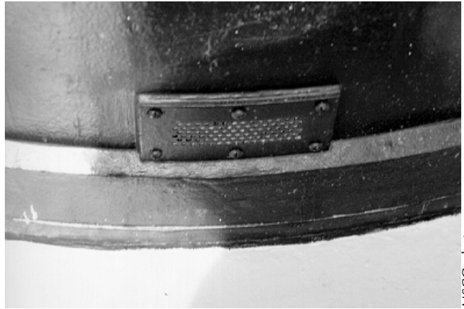
Figure 19 (left). Buildup of rust in parapet wall vents.