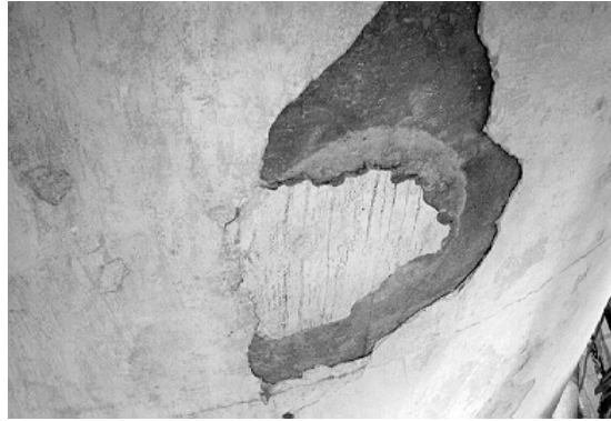
Figure 26. Once the scaffolding was erected, areas of the delaminated white mortar finish coat were removed.

One major area of concern was the concrete gallery deck located outside the lantern. This deck had considerable damage in two areas without any evidence of the cause. The outer rebar showed signs of corrosion but the damage went 18 to 24 inches deeper into the concrete. Since freezing was not an issue, the cause of the damage was at first unknown. Closer examination revealed signs of an explosion inside the concrete, and we noticed bolt patterns for two old antenna mounts directly above the area. We determined lightning to be the cause. There was no practical way to dig out the