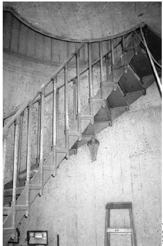
Figure 25. After the cast-iron stairs were blast-cleaned, they were rinsed to remove all traces of lead dust; flash rust immediately formed (as seen in this photo). Before painting, this light rust was removed with wire brushes.