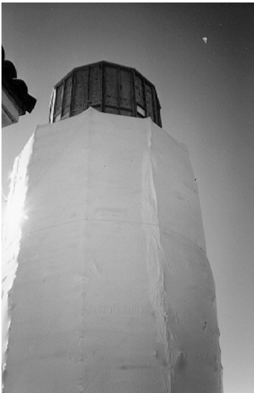
Figure 21. View of the plywood lantern enclosure and scaffolding.