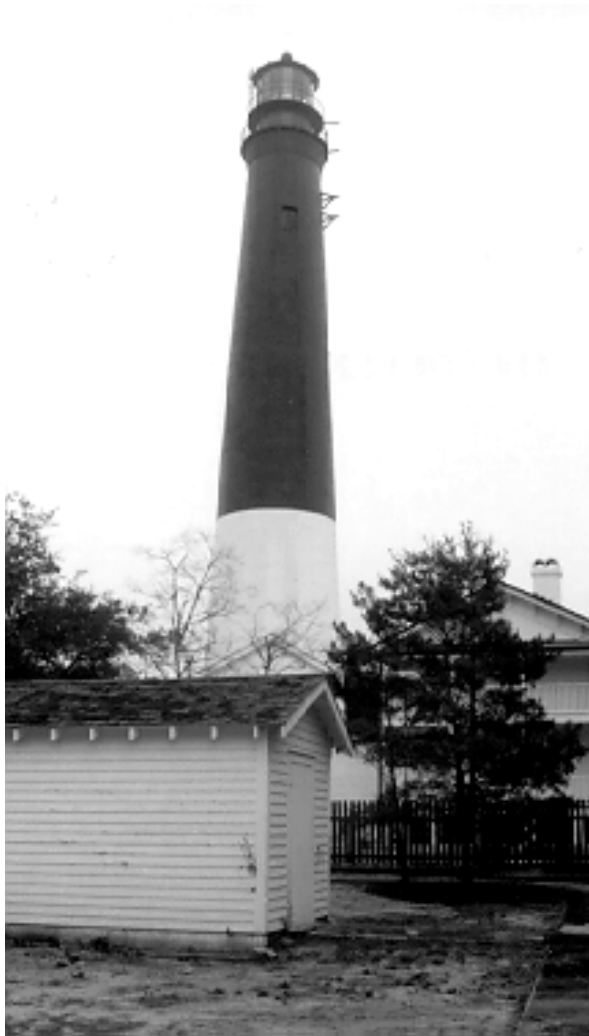
Figure 4. Brick masonry construction in the 171-foot-tall Pensacola Lighthouse in Florida.

In some instances the vulnerable, softer masonry surfaces were not covered with a protective coating, or the protective coating was not maintained and the masonry has since deteriorated. In these cases the protective coating needs to be reinstalled after the required repairs are made, or the masonry may need to be consolidated by a qualified architectural conservator.