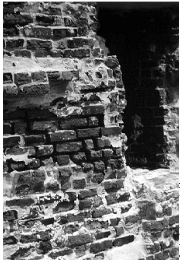
Figure 5. The coating that once protected the soft bricks of this lighthouse was not maintained; the severe deterioration required the replacement of nearly 25,000 bricks.

Masonry lighthouses are typically constructed in one of two configurations: solid wall or hollow cavity wall. Shorter towers tend to be solid-wall construction because the cross section of wall can be thin enough to support the lantern and interior stairs as well as economical to build. Tall towers are typically constructed with radiating cavities or voids. The exterior of the tower is the frustum of a cone while the interior is typically a cylinder. From the cylinder are radiating walls that tie into the exterior walls and create voids or cavities. The voids in the wall structure save weight while at the same time do not compromise the strength of the wall. The voids are typically vented to encourage air movement through the internal cavities. This ventilation system should be preserved and maintained.