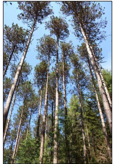
Trees stretch to the sky in Marsh-Billings-Rockefeller National Historical Park.