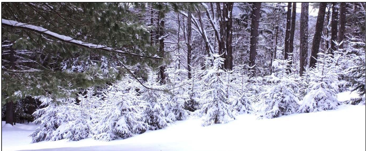
Snow blankets tree regeneration in Marsh-Billings-Rockefeller National Historical Park in February 2015.

The big trees catch the eye. The stories of birds benefiting from forest management make an impact. Honoring the intentions of the Marsh, Billings, and Rockefeller families respects the past. All these things make indispensable, enduring impressions that teach and espouse forest stewardship.