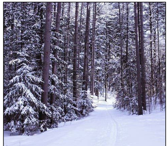
A cross-country ski trail winds its way through a forest in Marsh-Billings-Rockefeller National Historical Park.