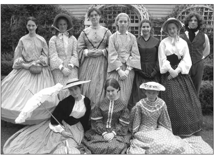
Concordant Junior Volunteers who helped out on Family Day, September 2005

the role of a particular individual whom they have studied, and s/he will be stationed in the House's first-floor historic rooms. Written by the volunteers themselves, the re-enactment places the characters in the rooms chronologically so