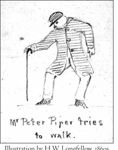
Illustration by H.W. Longfellow, 1860s

Longfellow's journals and the drawings and stories he produced for his children reveal that he was "a devoted father and, in many ways, a rather non-traditional one," especially in mid-nineteenth century New England, according to Irmscher, who refers to what he calls Henry's "democratic view of fatherhood." Longfellow imagined the family not as the playground of patriarchal power but as a potentially egalitarian space, inhabited by people with different but equally interesting personalities: a space in which the father and his children were-to adapt Longfellow's line from "The Children's Hour"-truly "matches" for each other. In his book, Irmscher argues that "the same lack of hierarchical thinking also influenced Longfellow's conception of literature as a transnational conversation carried on across social and linguistic boundaries. For him, the poet was less Emerson's 'liberating god' than the distributor of cultural goods democratically shared by authors and readers alike."