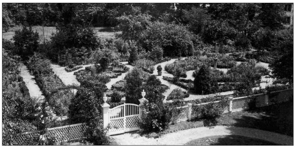
Aerial view of the Longfellow House formal garden, 1935

Martha Brookes Hutcheson wrote in a letter in response to the Historic American Building Survey in 1936, "The Longfellow Garden at Cambridge I overhauled entirely. It had gone to rack and ruin. I reset box in the Persian pattern which the poet had