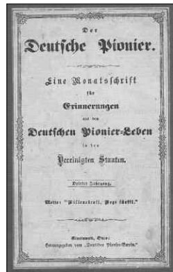
From Longfellow's library: Der Deutsche Pionier [ The German Pioneer ], printed in Cincinnati, 1872