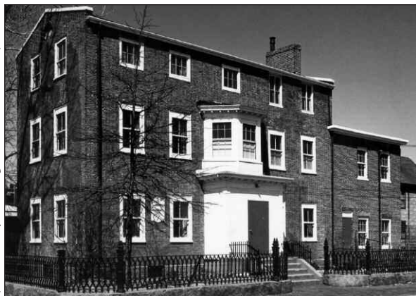
Cambridge Neighborhood House, 79 Moore St., demolished 1973

Founded as a day nursery and kindergarten by Pauline Agassiz Shaw (daughter of the naturalist Louis Agassiz) in 1878 at the corner of Harvard and Moore Streets, the Cambridge Neighborhood House developed into the first settlement house in America, predating Jane Addams's Hull House in Chicago by more than a decade. Familiar with conditions in this rapidly industrializing section of Cambridge, Shaw purchased the Dickinson estate and converted it into a library, reading room, classrooms for sewing and woodworking, and a playground. Open to all nationalities and all ages, the activities grew to offer summer camps, music and art classes, choral groups, nurses' training programs, clinics for expectant mothers, and more.