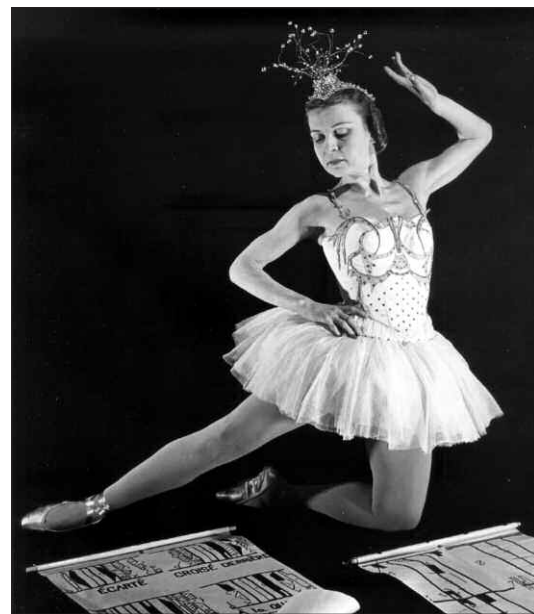
Ann Hutchinson Guest, 1957