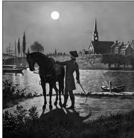
Print produced for the Revere Copper Co., 1942