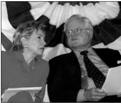
Kennedy & Hillary Clinton, NPS 30th, 2002

was instrumental in obtaining Congressional approval of funds to renovate the carriage house. The money made it possible to transform it into a much-needed space for public events, such as lectures, programs for school groups, and conferences.