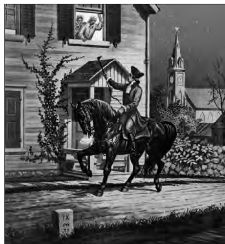
Print produced for the Revere Copper Co., 1942

Ticknor and Fields published the epic tale in their 1866 revised edition of The Poetical Works of Henry Wadsworth Longfellow , and