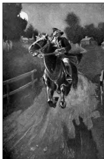
From Tales of a Wayside Inn , 1906