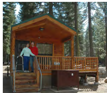
Manzanita Lake camping cabin