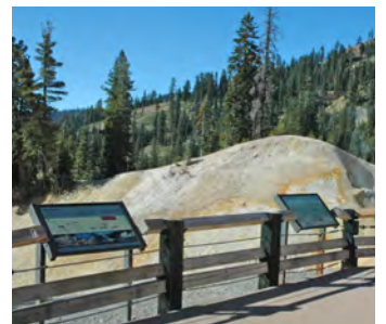
Sulphur Works interpretive displays