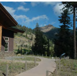
Geologic walk through time

Superintendent, Lassen Volcanic National Park, P.O. Box 100, Mineral, CA 96063.