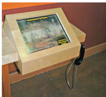
Interactive trip planning display

Lassen has several picnic areas in which to enjoy an afternoon in the park. Manzanita Lake, Lake Helen, Devastated Area, and Kings Creek picnic areas offer level sites, accessible restrooms, and accessible parking.