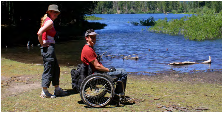
An assisted mobility impaired visitor explores Manzanita Lake