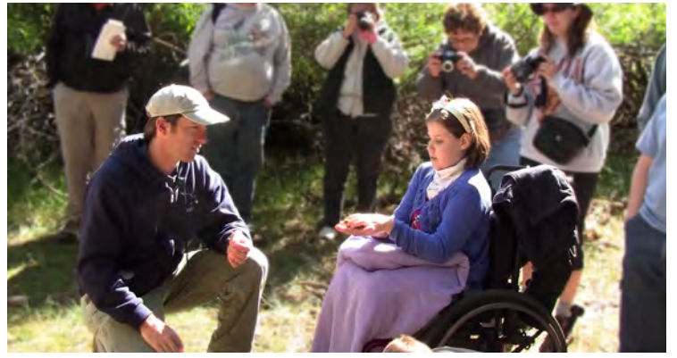
A young girl releases a yellow warbler at a bird banding demonstration