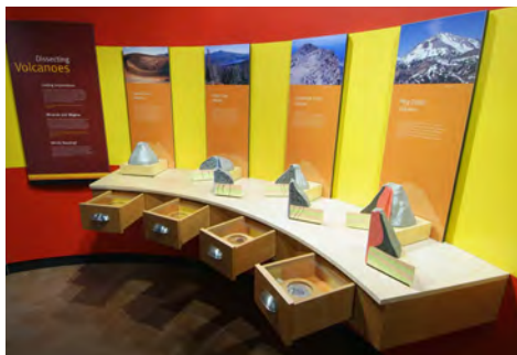
Tactile volcano model exhibit