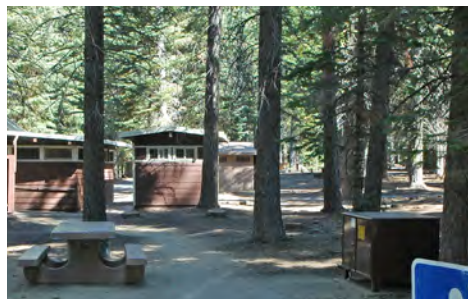
Manzanita Lake accessible campsite