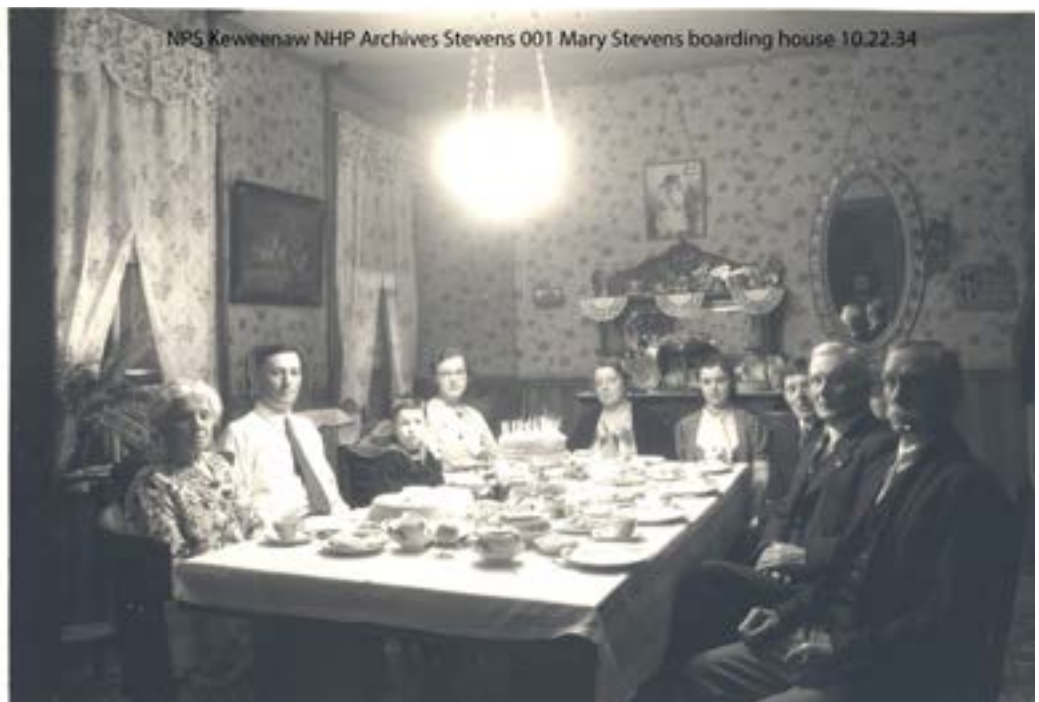
Boarders eating dinner at a boarding house.