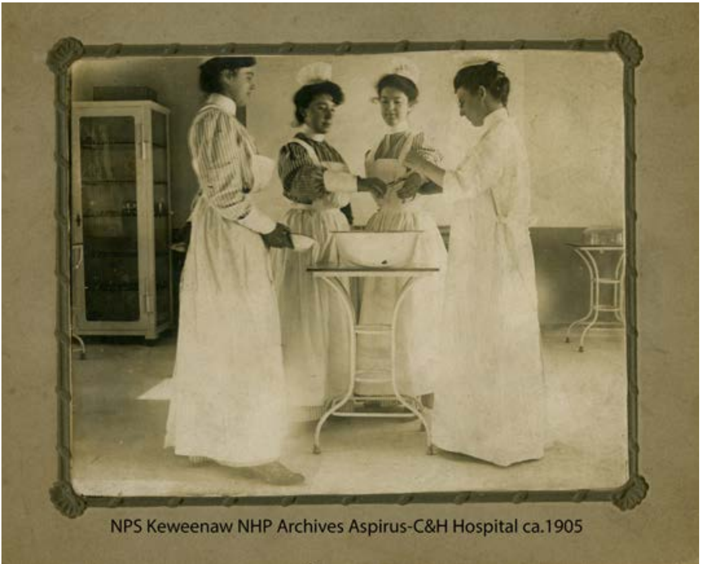
Aspirus-C&H Hospital ca.1905