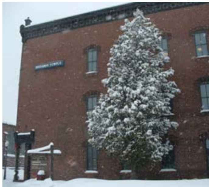
Two different viewpoints of Calumet Visitor Center