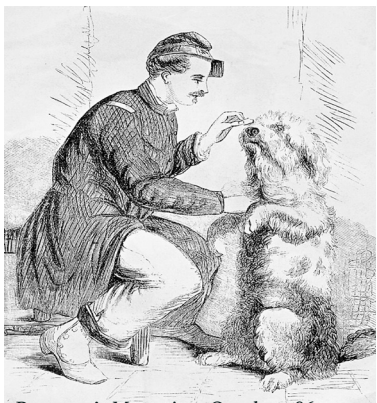
Peterson's Magazine, October 1863