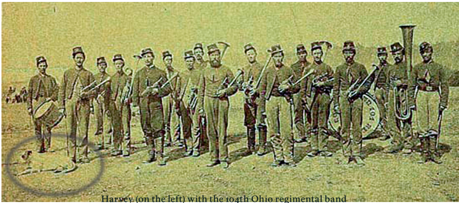
Harvey (on the left) with the 104th Ohio regimental band