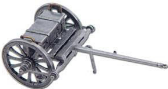
Limber from the Civil War era

A little dog named Charlie accompanied a battery from Athens, Georgia. The Troup Artillery, named after one of Georgia's governors, was assigned to General Robert E. Lee's Army of Northern Virginia. Charlie wasn't very pretty, nor did he possess any illustrious pedigree, but he was loved by the soldiers. Courageous under fire, Charlie would follow his men into battle, running up and down the line of cannon while wagging his tail as shells flew over his head. He could always be found at the front lines at the points where lead filled the air. An official member of the Troup Artillery, Charlie sat atop the box of an artillery limber as the guns rolled down the road to the next battle. He was even saluted by General Lee himself during a review of the army in June 1863. (Charlie barked and wiggled in response.)