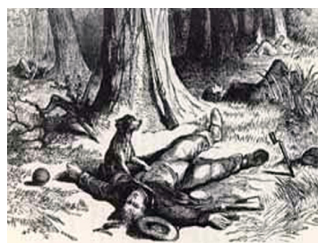
Dog staying with his fallen master, Frank Leslie's Illustrated

In 1861, men marched off to war carrying a menagerie of creatures: regiments and companies were represented by cats, bears, goats, pigs, and birds, including a patriotic bald eagle. However, the most popular mascots were dogs. Even though the Ninth Connecticut Infantry's pig, "Jeff Davis," could stand on its hind legs and fall into line during inspections, and the 43rd Mississippi's camel would watch over his men and never stray, dogs remained the most common and beloved mascots of the Civil War.