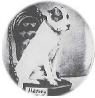
Harvey depicted on a 104th Ohio Infantry reunion keepsake button