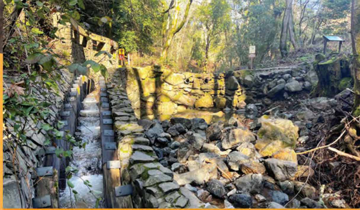
Native trout use a constructed fish ladder to seasonally migrate up Redwood Creek.

Visitors are responsible for knowing and complying with park rules (Ordinance 38). See ebparks.org/rules .