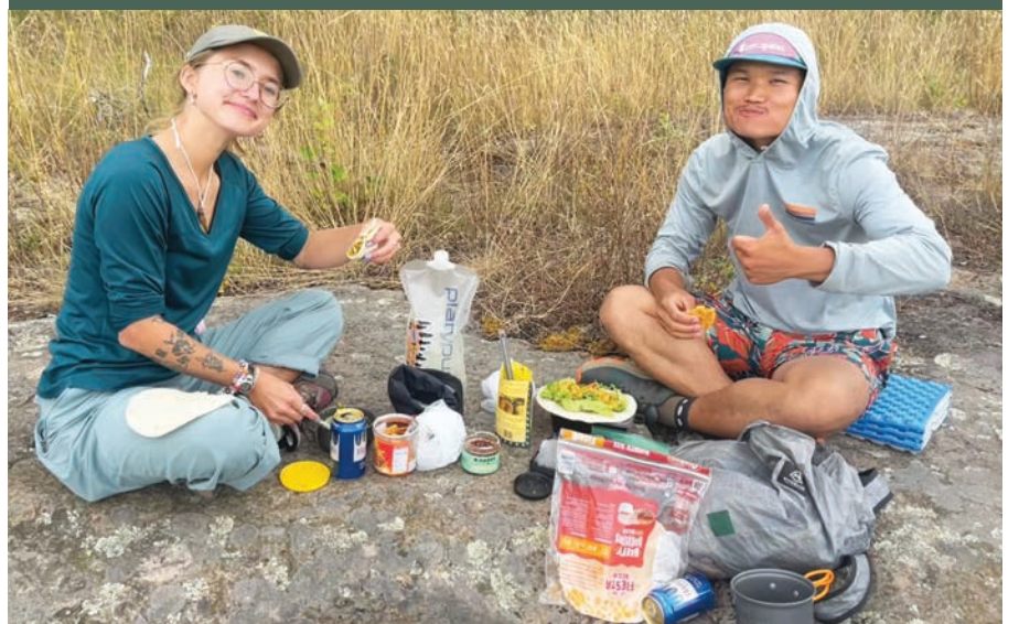
An arm's length away, you're okay. Otherwise, put it away!