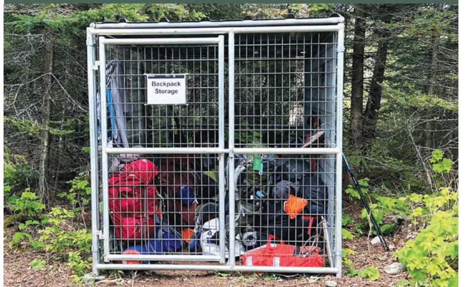
Store pack/gear/supplies in backpack storage areas located in Rock Harbor and Windigo/Ozaagaateng.