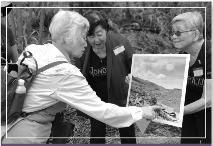
On site tours, historic photos are used to illustrate the World War II conditions (2016).