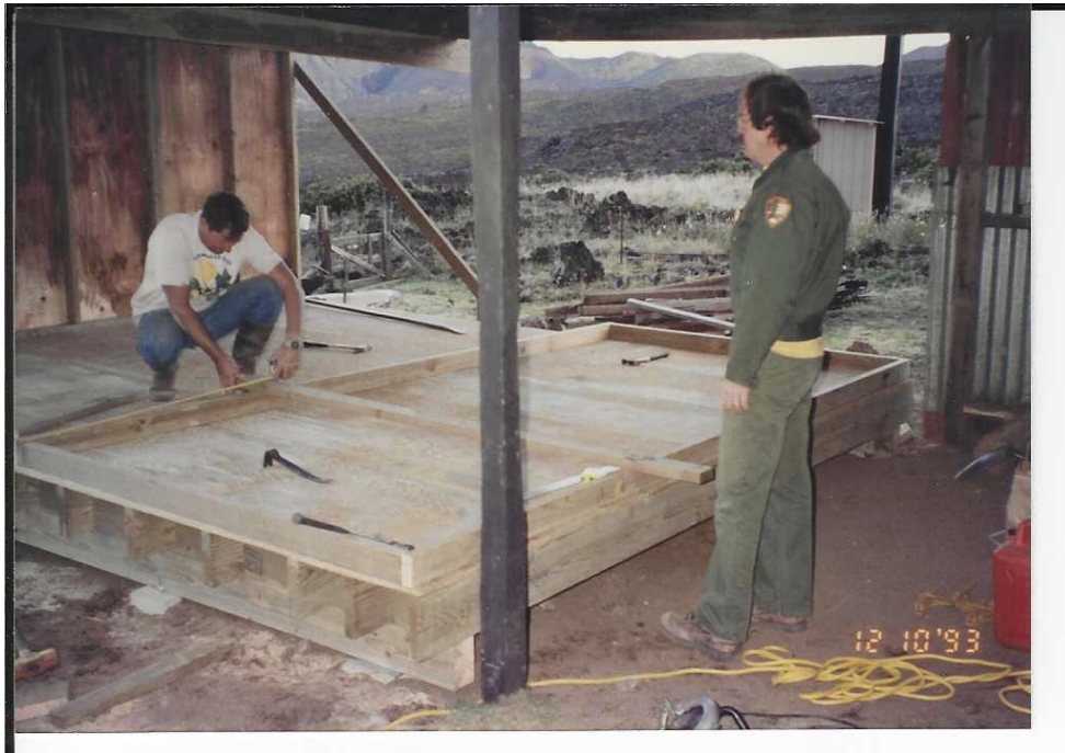
Hōlua Hilton new floor