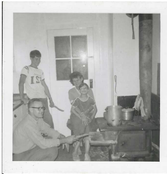
Hōlua Cabin Kitchen Pot Belly Stove, 1969