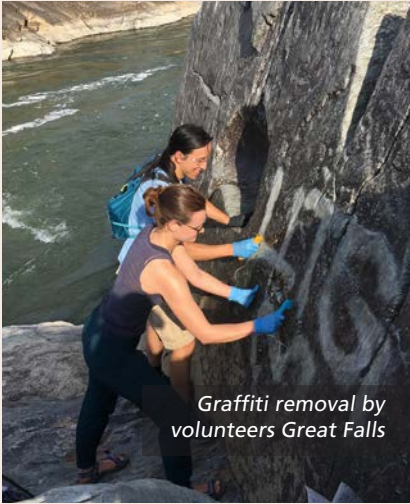
Graffiti removal by volunteers Great Falls