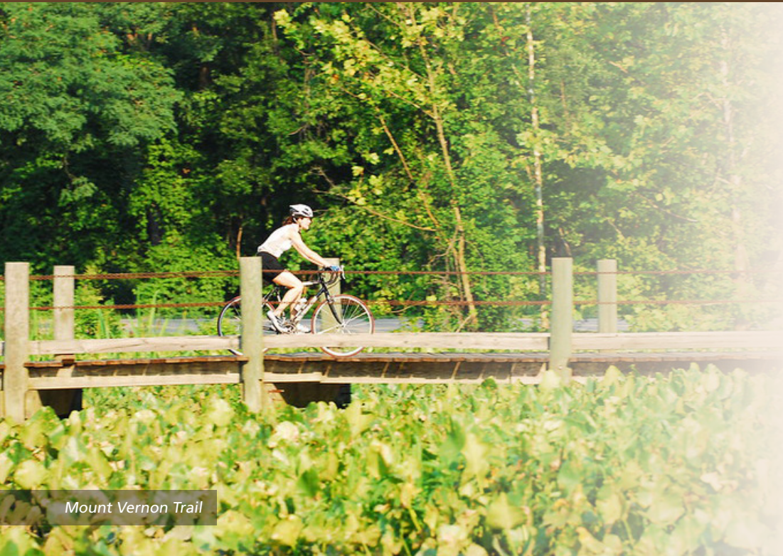
Mount Vernon Trail