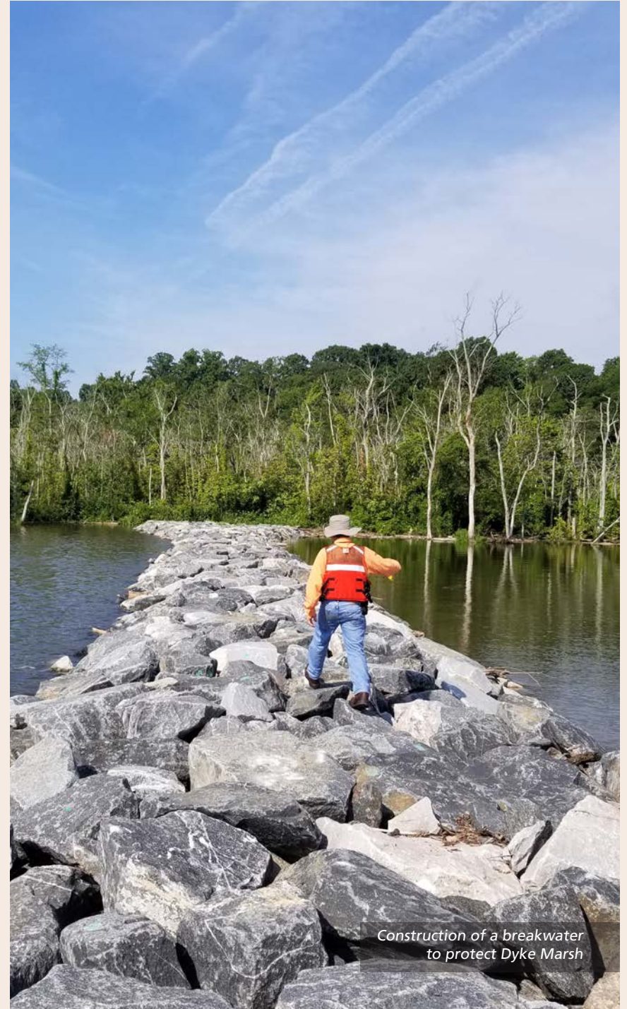
Construction of a breakwater to protect Dyke Marsh