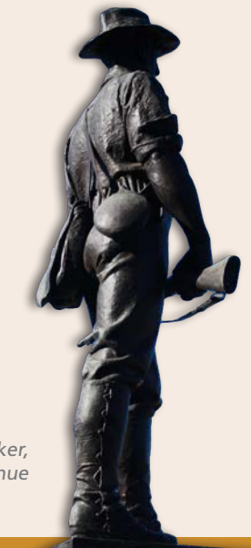
The Hiker, Memorial Avenue