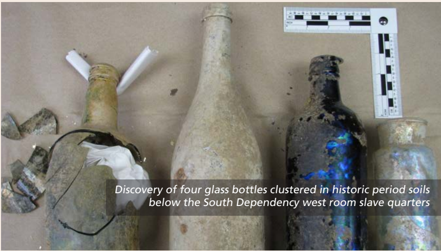
Discovery of four glass bottles clustered in historic period soils below the South Dependency west room slave quarters