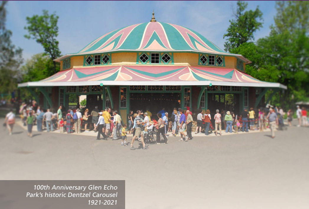
100th Anniversary Glen Echo Park's historic Dentzel Carousel 1921-2021

Your voice holds immense power. Use it to: