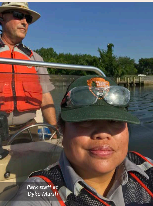
Park staff at Dyke Marsh