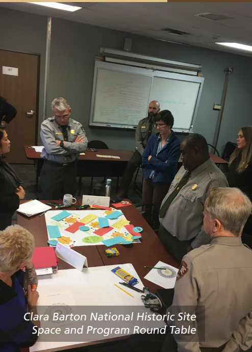
Clara Barton National Historic Site Space and Program Round Table