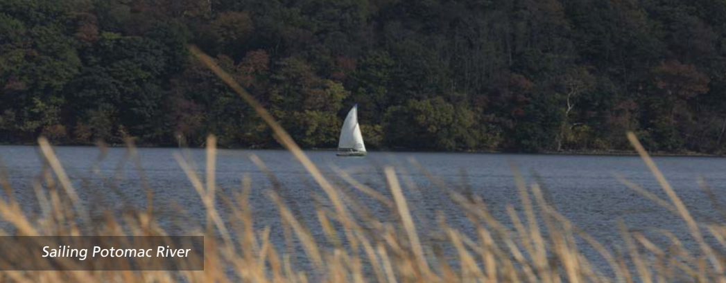
Sailing Potomac River