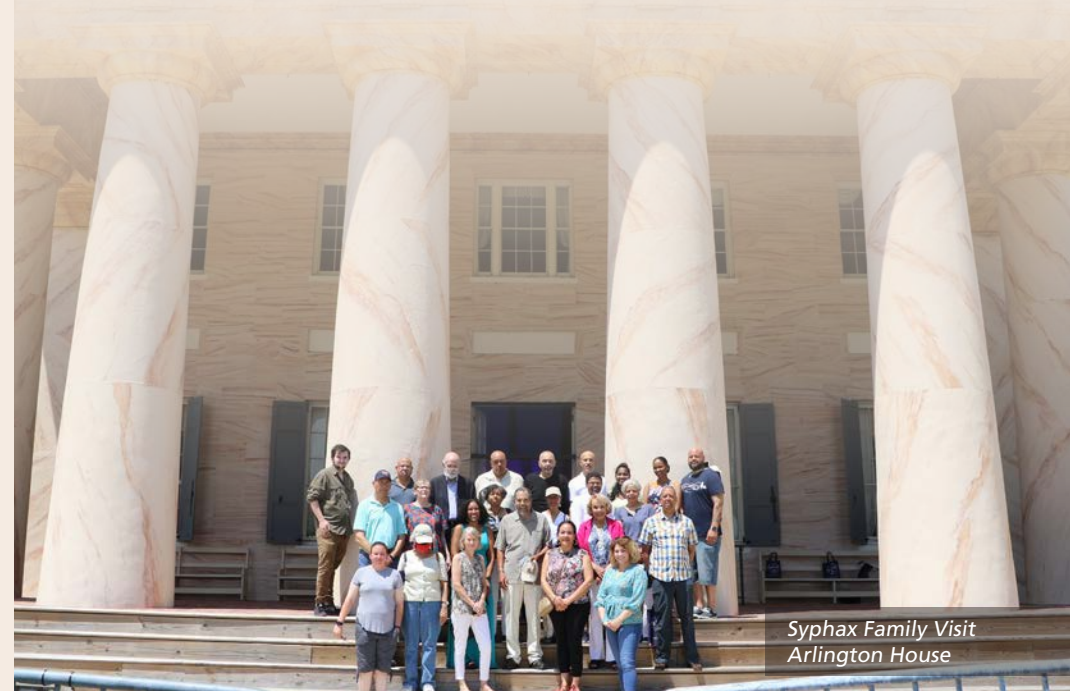
Syphax Family Visit Arlington House

One Park—One Team: Working together as one park—one GWMP/NPS team focused on preserving and protecting the parkway for future generations. Embodying the mindset that our success as a park depends on us reaching across divisions and districts to accomplish our mission.