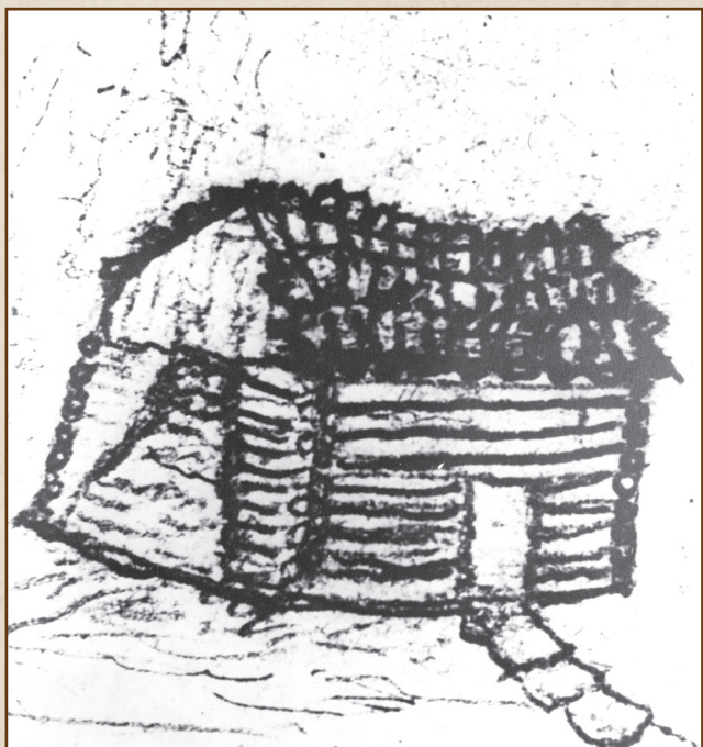
George Washington Carver's Sketch of the Log Cabin