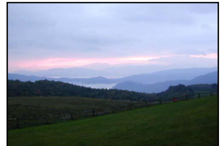
Clockwise from top left: Big South Fork, Obed Wild and Scenic River, Purchase Knob (Great Smoky Mountains), and Blue Ridge Parkway.

In addition to financial support, the Center may also provide desk and lab space, GIS, and housing to researchers out of the facility at Purchase Knob for projects that are particularly relevant to park science needs.