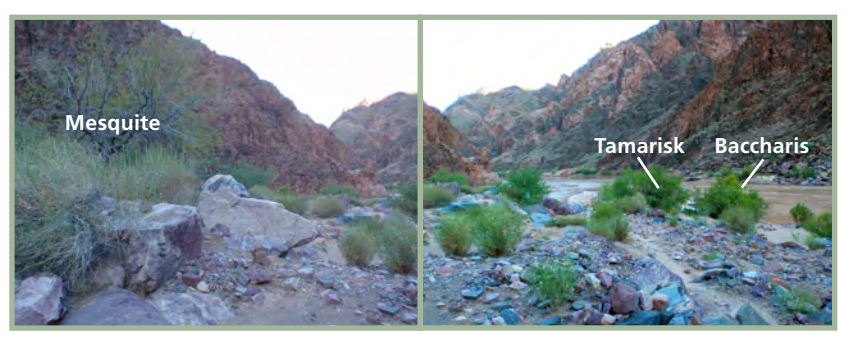
Mature mesquite live in the old high-water zone.

Soap Creek (River Mile 11.3) exhibits a good example of the old high-water zone. Follow the established trail leading out of camp and look for sandy slopes, sandy terraces, biological soil crusts, and historic driftwood. The Nankoweap area (River Miles 52 – 54) also displays obvious characteristics of the old high-water zone.