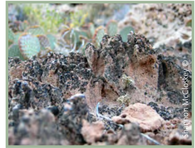
Biological soil crusts are an indicator of the old high-water zone.

Biological soil crusts also known as cryptobiotic soil, are a diverse community of living organisms such as algae, cyanobacteria (bluegreen algae) bacteria, lichen, mosses, liverworts, and fungi.