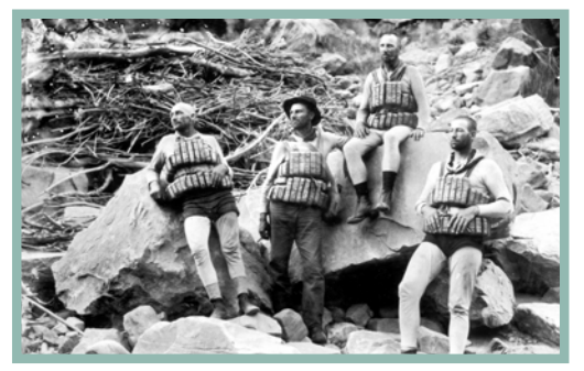
Members of the Best Expedition pose for photo in front of driftwood. Circa 1891.

Gathering of wood from any tree standing, fallen, dead, or alive, is prohibited. Dead and down wood eventually breaks down into soil and provides habitat to wildlife. Also, sometimes plants appear to be dead when they are still alive.