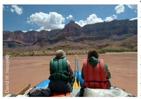
Travel together and make sure everyone always wears his or her life jacket.

Although sometimes practiced on other rivers, it is against regulation and is considered poor etiquette in Grand Canyon. Groups that spread out during the day make the river feel crowded to other groups. Traveling together is safer. If