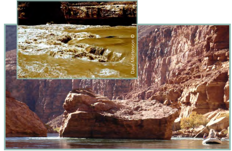
The 1957 photograph on the top left depicts the river flowing over the boulder at Boulder Narrows at an estimated 122,000 cfs. The 2009 photograph behind it shows the river at an estimated 10,000 cfs. The historic driftwood on top of the boulder was probably deposited during the 1957 spring runoff.