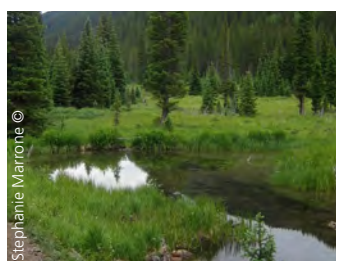
The clear headwaters of the Colorado River, Rocky Mountain National Park

After the Colorado River leaves the Rocky Mountains, it journeys into the Colorado Plateau where it picks up sediment and moves it downstream like a conveyor belt. This moving silt, sand, and rock scour the bottom of the river's channel, deepening and widening it along the way. The rocks above the channel are also exposed to weathering and erosion, which widens the canyon. The gradient of the Colorado River and the material it moves make this desert river powerful. In Grand Canyon National Park alone, the Colorado River drops more than 2,000 ft. over 277 miles. Over its entire 1,450-mile course to the Gulf of California, it drops more than 14,000 ft.