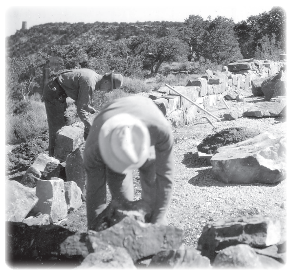
CCC "boys"at Navajo Point; note the Watchtower on the horizon

As you walk the path up the hill, reflect back to the men of the Civilian Conservation Corps (ccc) who lived and worked at Grand Canyon from 1935 to 1942. While living in barracks, they completed more than twenty projects at Desert View including trails, rock walls (below), roads, and buildings. Ccc crews built the stone-walled building on your left (2) in 1941 as a restroom. The crews' attention to detail shows the pride they had in their accomplishments.