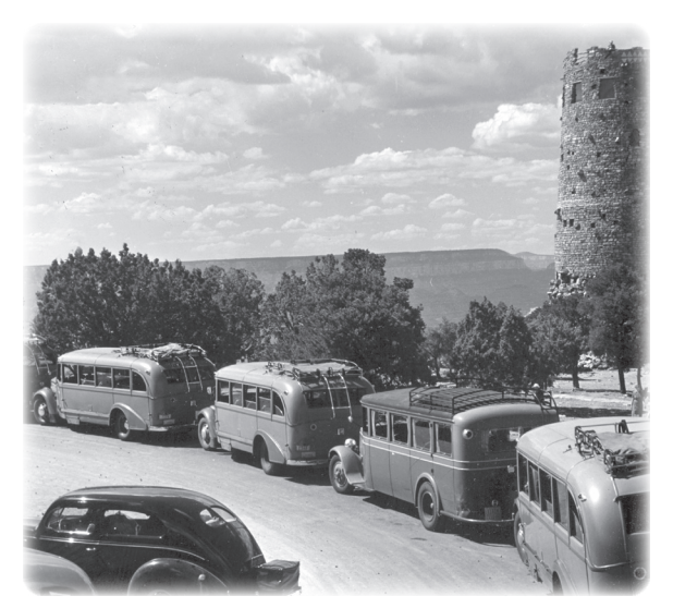
Fred Harvey buses at Desert View ca. 1938