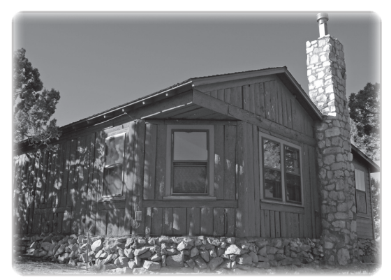
Caretaker's Cabin today