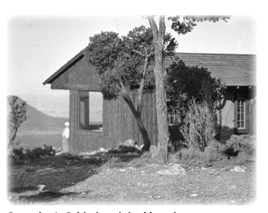
Caretaker's Cabin in original location

On the left farther along the path, the house with two chimneys (3) (below) is the oldest building at Desert View. Originally constructed near the rim in 1927, it served as a place for visitors to rest, eat, and view the canyon. Following the construction of the Watchtower, it was moved to its current location and functioned as the caretaker's cabin. It retains some of its original glass and exterior siding and stone work, and today is used as an office. Imagine all of today's visitors trying to enter this building for tea!