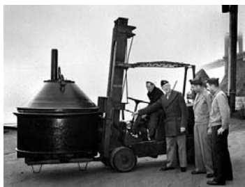
Battery Chamberlin's guns protected underwater mines like this one.

Battery Chamberlin, the last Endicott-era battery built at the Presidio, was completed in 1904 and initially armed with four 6-inch guns. These guns were mounted on disappearing carriages, which allowed the gun and crew to be hidden behind a concrete shield during aiming and loading. The battery protected underwater minefields located outside the Golden Gate from enemy minesweepers and moderate-sized warships. Its guns had a range of 8 miles and each could fire at the rate of two rounds per minute. Most of the guns around the Golden Gate ranged