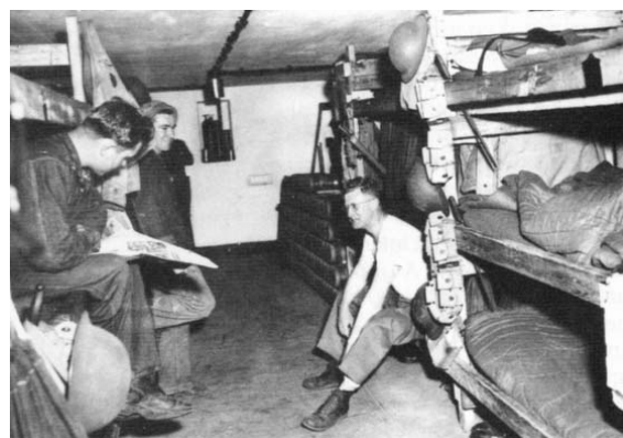
Cramped sleeping quarters in Chamberlin's shell room, 1942.

batteries disarmed, and the guns scrapped during "Operation Blowtorch." A new era of air and missile defense had arrived, ushering in the Cold War and nuclear brinkmanship with the Soviet Union.