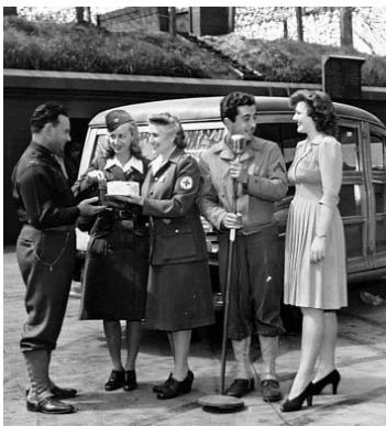
Red Cross Cookie Brigade visits Battery Chamberlin during the war.

After Pearl Harbor, the West Coast was on high alert for an expected Japanese attack. The Sixth Coast Artillery Regiment, Battery "D," manned the guns at Chamberlin, which were hidden from aircraft by camouflage netting. The soldiers had to be ready to defend at a moment's notice. They slept in cramped makeshift bunks in the battery's magazine (ammunition storage room). A mess hall and additional underground barracks were built, but the attack never came.