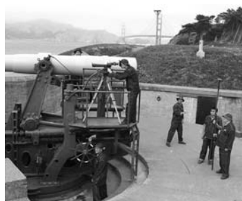
Join a Gun demonstration.

Today, you can take part in demonstrations of a 50-ton rifle and relive the duties of a soldier preparing for imminent attack. The underground magazine is now a museum, with photos and exhibits on the coastal defenses of San Francisco. Here you can contemplate the role these men and weapons played in our nation's security.