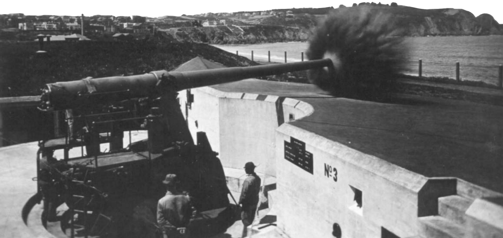
Practice firing of an original 6-inch gun mounted on a disappearing carriage, around 1910.