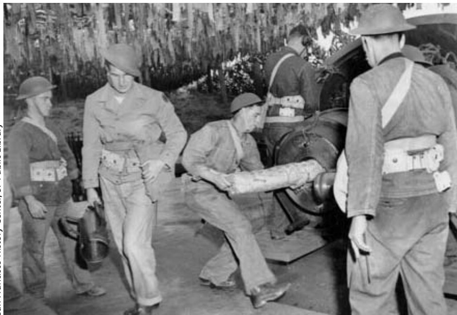
Gun drill at Battery Chamberlin around 1942. One soldier loads the gun powder bag as another with shell ladle withdraws.

bring forward the 100-lb. shell on a ladle, followed by another with a long pole who rams the shell into the barrel's breech. The bag of gunpowder is heaved in behind, and the breechblock is swung shut and locked. Still another soldier trips a lever, and the gun springs up on massive arms, above the wall behind which it was hidden. The sergeant shouts "Fire!" and tugs on the long lanyard attached to the rear of the gun. There is a deafening boom, a tongue of flame, and a huge cloud of smoke! The shell speeds toward a target mounted on a raft seven miles out to sea. The gun recoils, swinging back and down, behind the wall of the battery the men stand poised to reload. Sweating in their fatigues, they silently thank the sea breeze for cooling them. Only thirty seconds have passed, and they are once again reloading the gun.